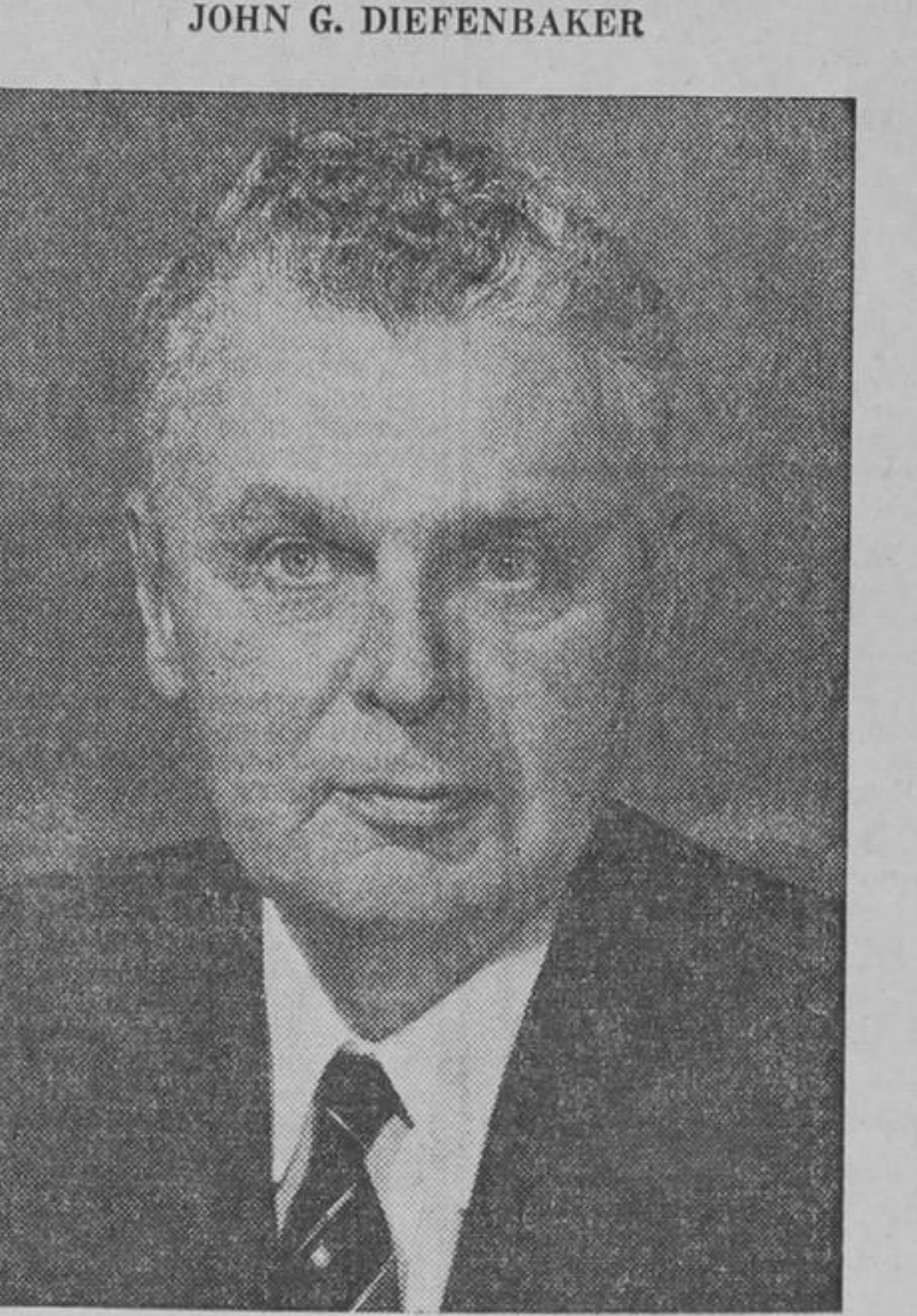
JOHN G. DIEFENBAKER

Painting AND Paperhanging WILLOW PAINTING CONTRACTORS CALL BA. 1-2861