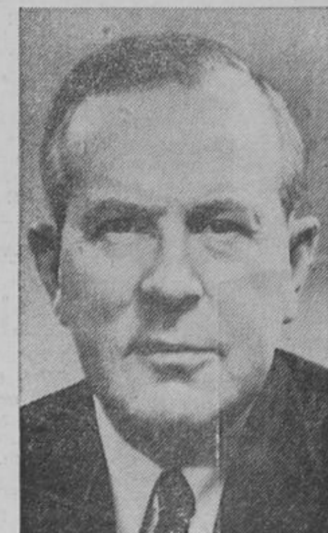
THE HON. L. B. PEARSON Leader of the National Liberal Party