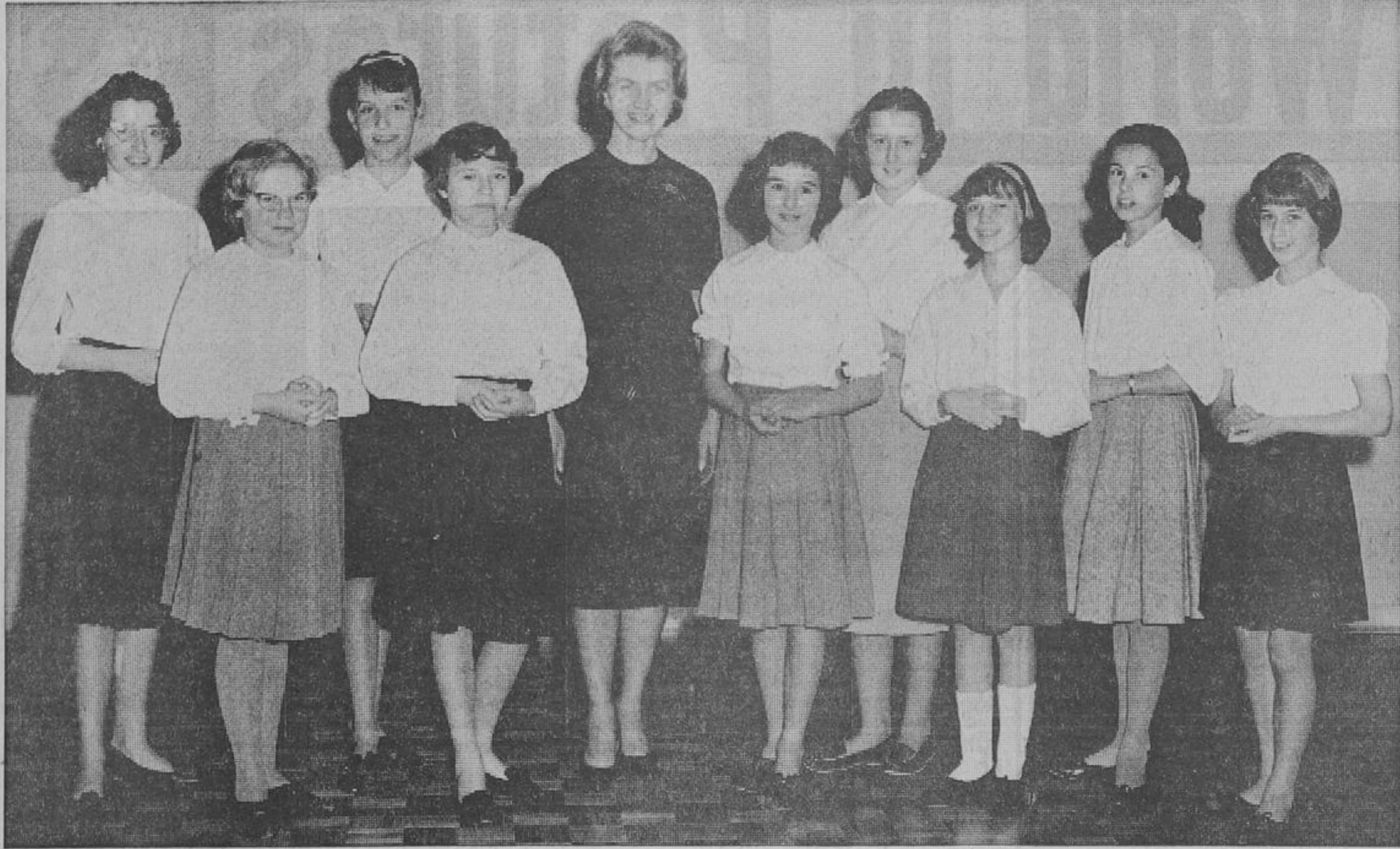
Another "first" for Richmond Hill was won at the recent Kiwanis festival held in Toronto, and pictured here are the people who scored it. The triple trio from grades 7 and 8 at the MacKillop Public School, competing in the class for girls