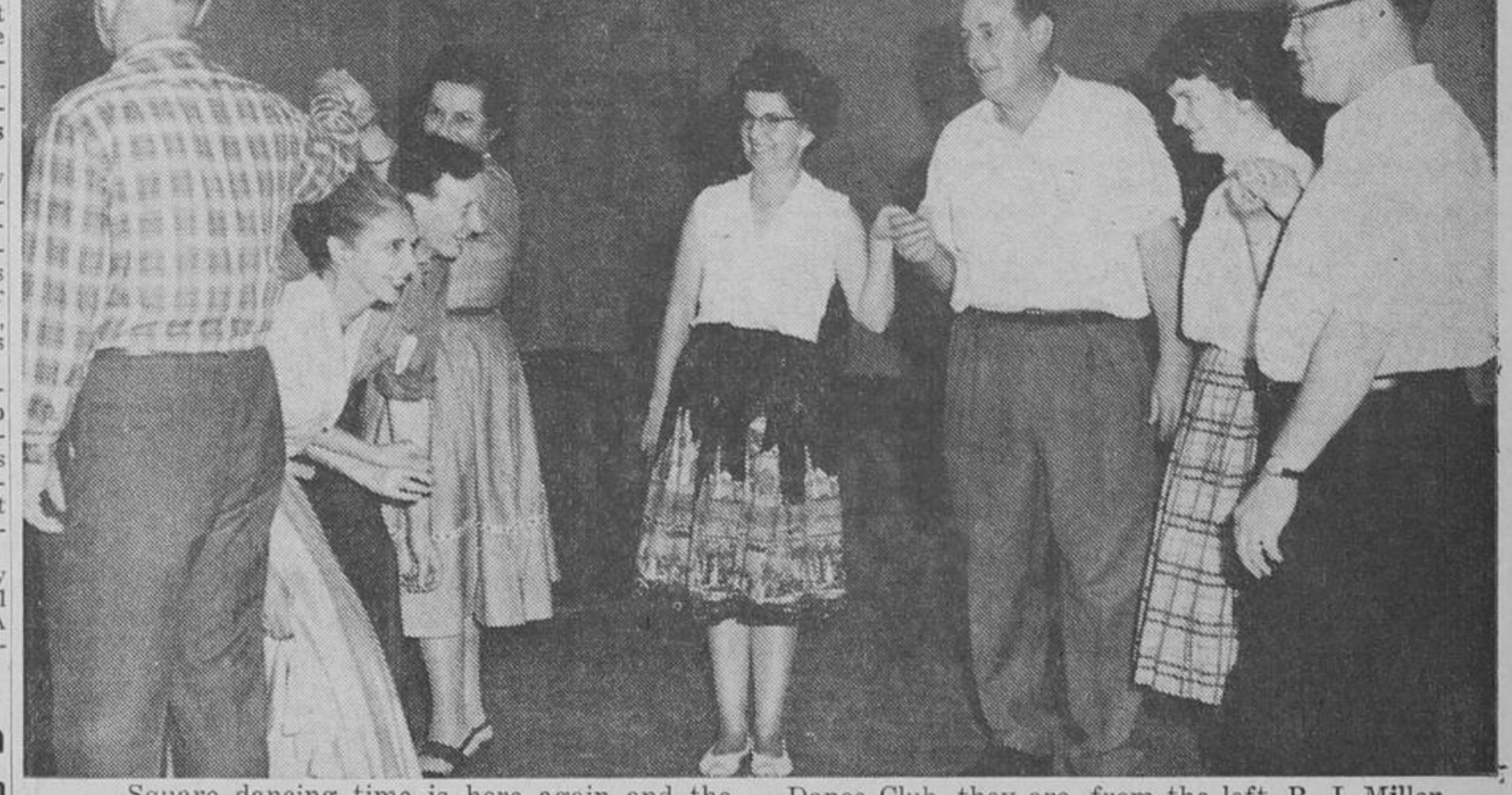
Square dancing time is here again and the eight Richmond Hillers pictured above are shown starting off the new season in McConaghy Public School. Members of the Richmond Hill Square