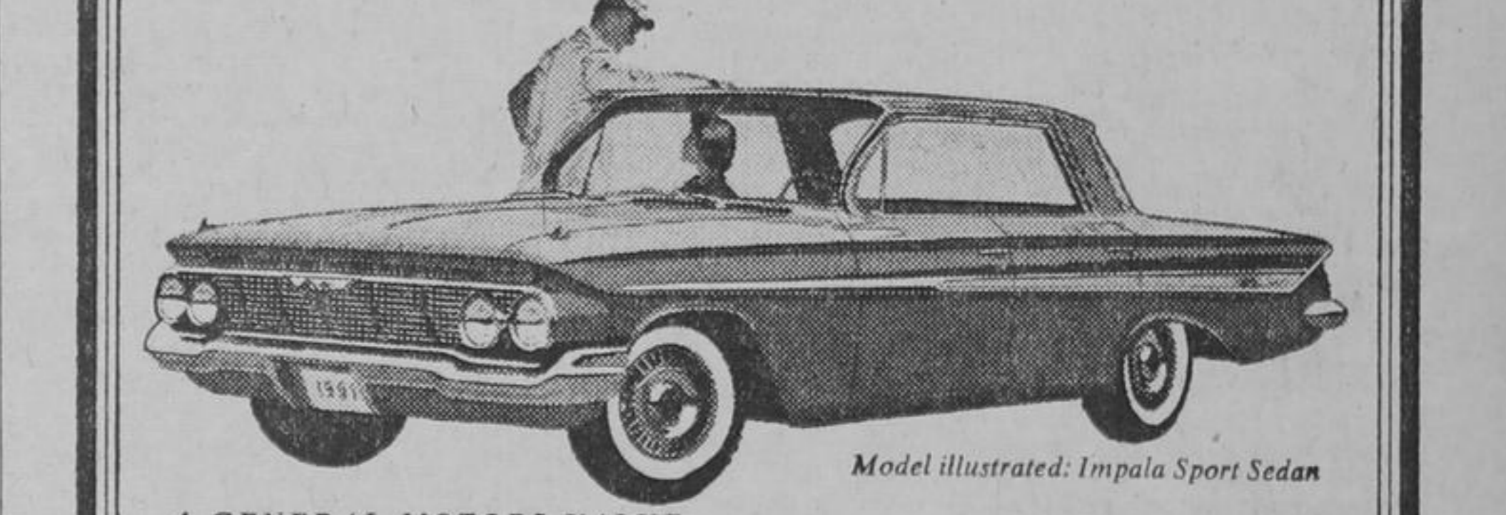
Model illustrated: Impala Sport Sedan A GENERAL MOTORS VALUE