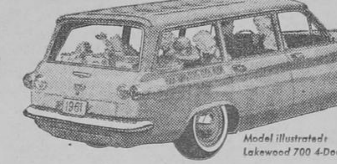
Model illustrated: Lakewood 700 4-Door Station Wagon K-551C

ALL-WEATHER COMFORT: In summer you appreciate the splendid ventilation, plus the fact that engine heat is behind you. And in winter, a hot air heater blankets you in warmth. ALL-WEATHER THRIFT: New engine air-flow control speeds warm-up — allows it to get to its gas-saving ways even faster than before. And, of course, Corvair needs no power brakes or steering, water pump, anti-freeze or even water! Try it for size! Try it for price! You'll see Corvair fits you and your budget in every way!