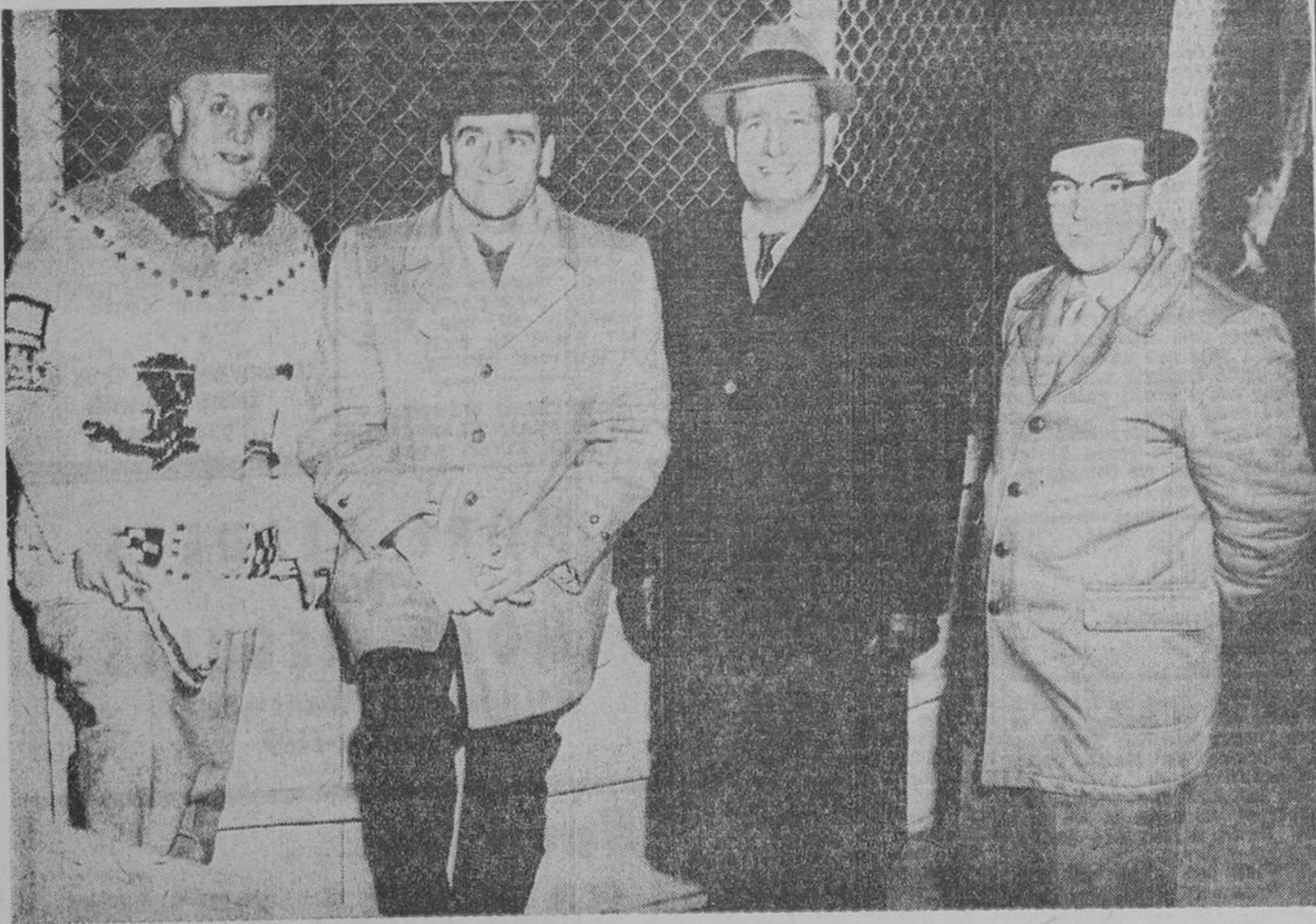
Key officials who have guided the destiny of Minor Hockey in Richmond Hill are shown above at the Richmond Hill Arena on Minor Hockey Night, last Friday.