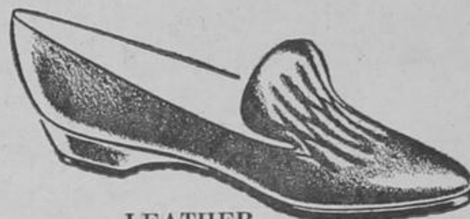
LEATHER — BLACK — BEIGE — PALE BLUE $5.95