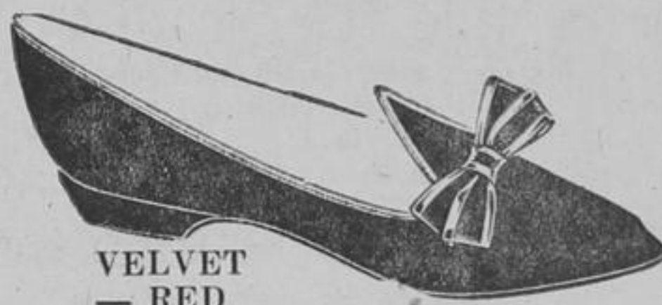
VELVET — RED — BLACK — TURQUOISE $5.95