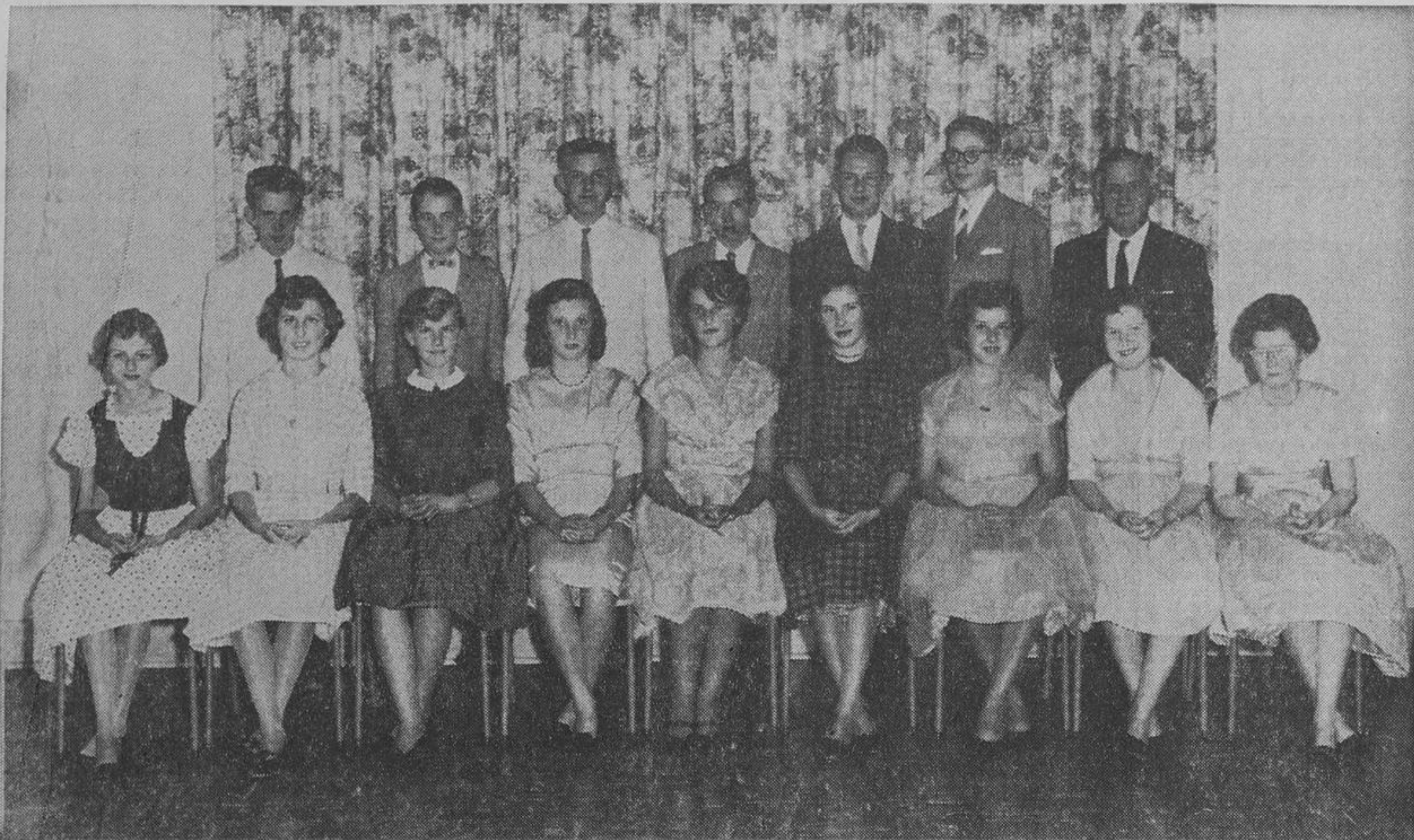
The annual graduation banquet for the pupils of Concord Public School who have now gone on to high school was held in Maple United Church on Monday, October 3, 1960, with the following graduates present: