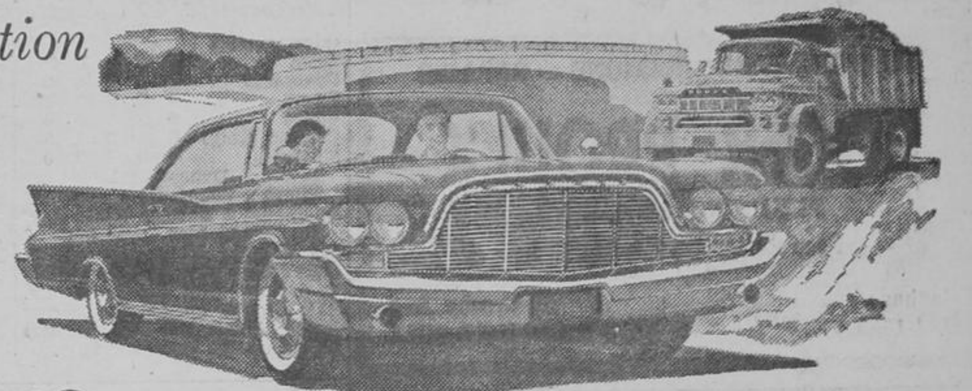
De Soto Adventurer... a quality product of Chrysler engineering.

There's a heady feeling of success in commanding a '60 De Soto. This is magnificence in action and, with De Soto's unique Uni-body construction, this is silence in action, too. Rattles and squeaks are a thing of the past. Be a De Soto man and experience the feeling of command and success.