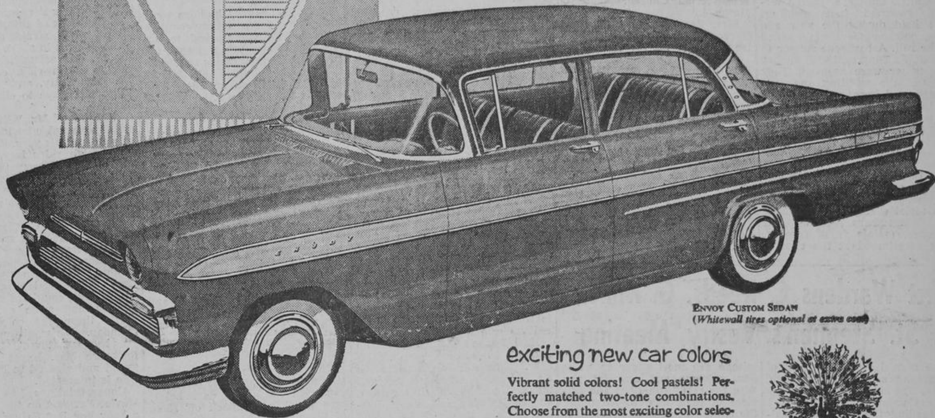
ENVOY CUSTOM SEDAN (Whitewall tires optional at extra cost)