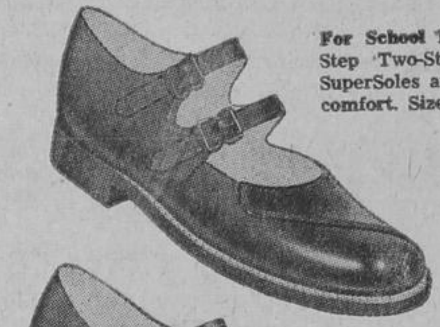
For School Days, these Guide-Step Two-Straps with leather SuperSoles are tops in style and comfort. Sizes 8 1/2 to 13. $7.95