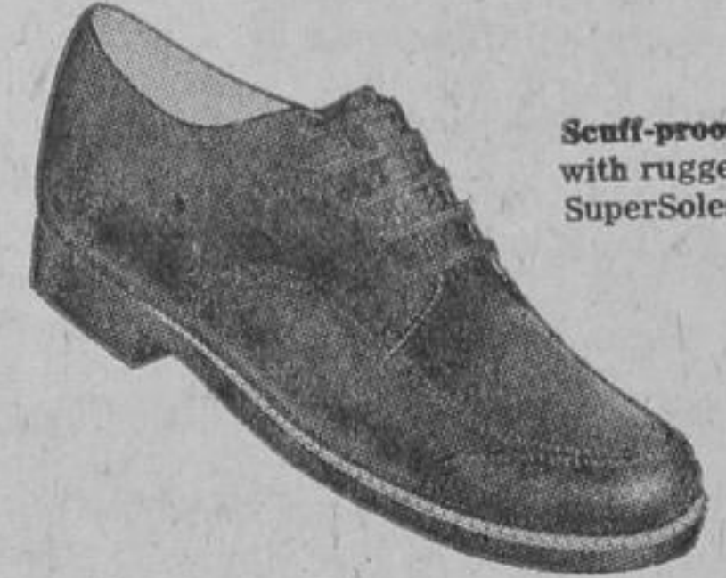
Scuff-proof Guide-Step Oxfords with rugged long wearing leather SuperSoles. Sizes 8 1/2 to 13. $7.95

Built into every pair of Guide-Step shoes are the precise curves needed to maintain correct foot balance and weight distribution—standing, walking or running. This is especially important in the years when the young foot is developing, forming and growing.