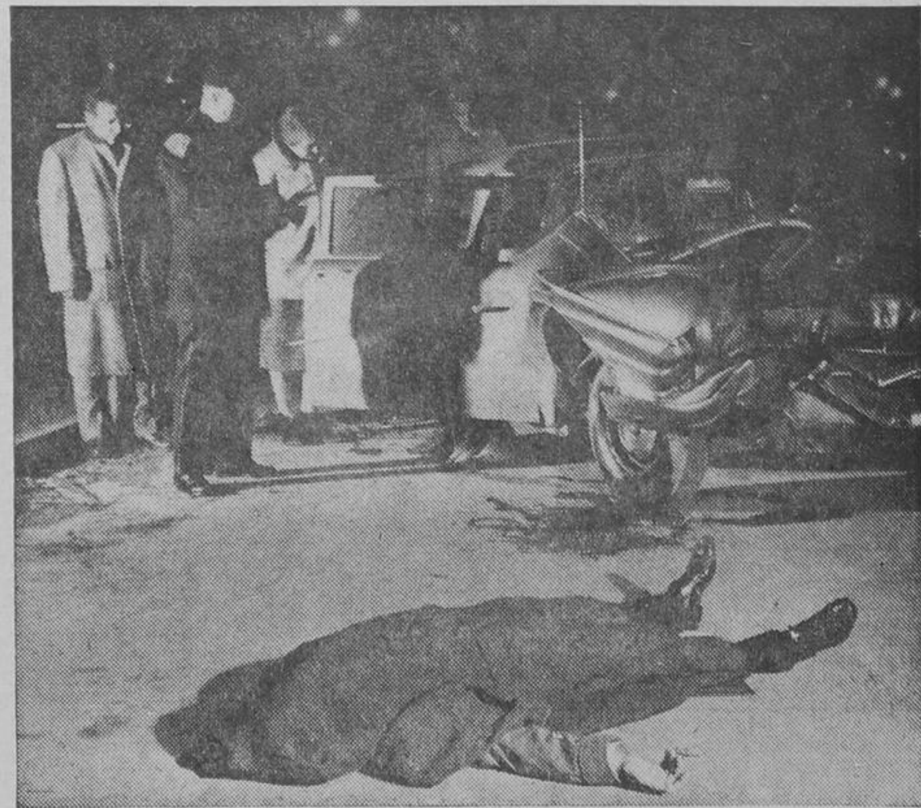
Meet Charlie, life of the party

COOK'S BP Auto Service Complete Service To All Makes Cars ELGIN MILLS TU. 4-3151