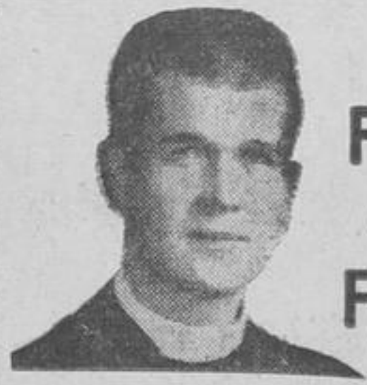
"Meekness Not Weakness"

Christianity has often been accused by its enemies of advocating weakness instead of strength. Especially when we consider the words, "blessed are the meek for they shall inherit the earth."