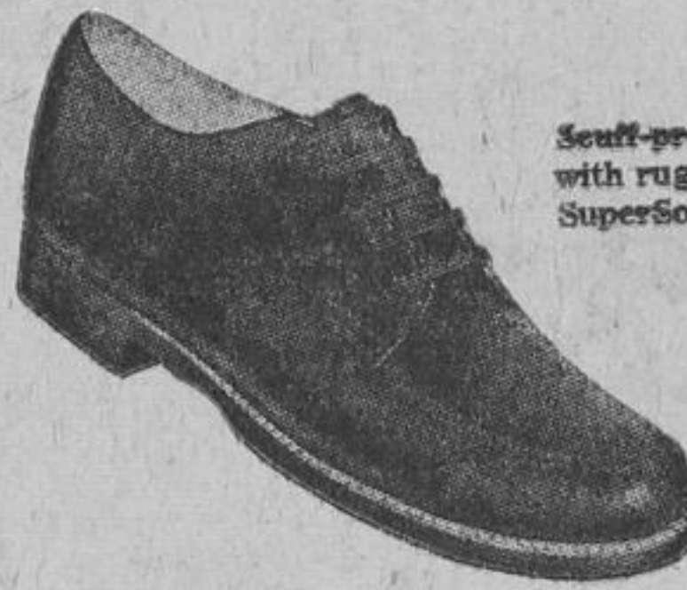
Scuff-proof Guide-Step Oxfords with rugged long wearing leather SuperSoles. Sizes 8 1/2 to 12. $7.95

Built into every pair of Guide-Step shoes are the precise curves needed to maintain correct foot balance and weight distribution — standing, walking or running. This is especially important in the years when the young foot is developing, forming and growing.