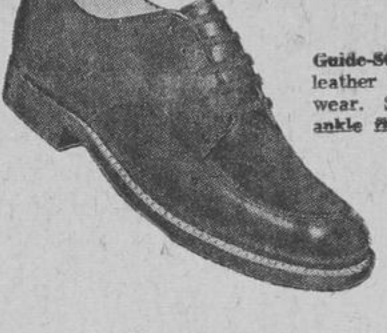
Guide-Step Dress Oxfords, with leather SuperSoles for extra wear. Styled to ensure snug ankle fit. Sizes 8 1/2 to 12. $7.95

Your Authorized Local Guide-Step Dealer is