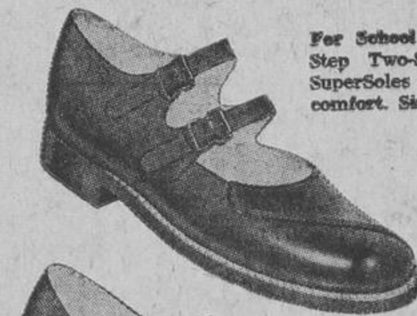
For School Days, these Guide-Step Two-Straps with leather SuperSoles are tops in style and comfort. Sizes 8 1/2 to 12. $7.95