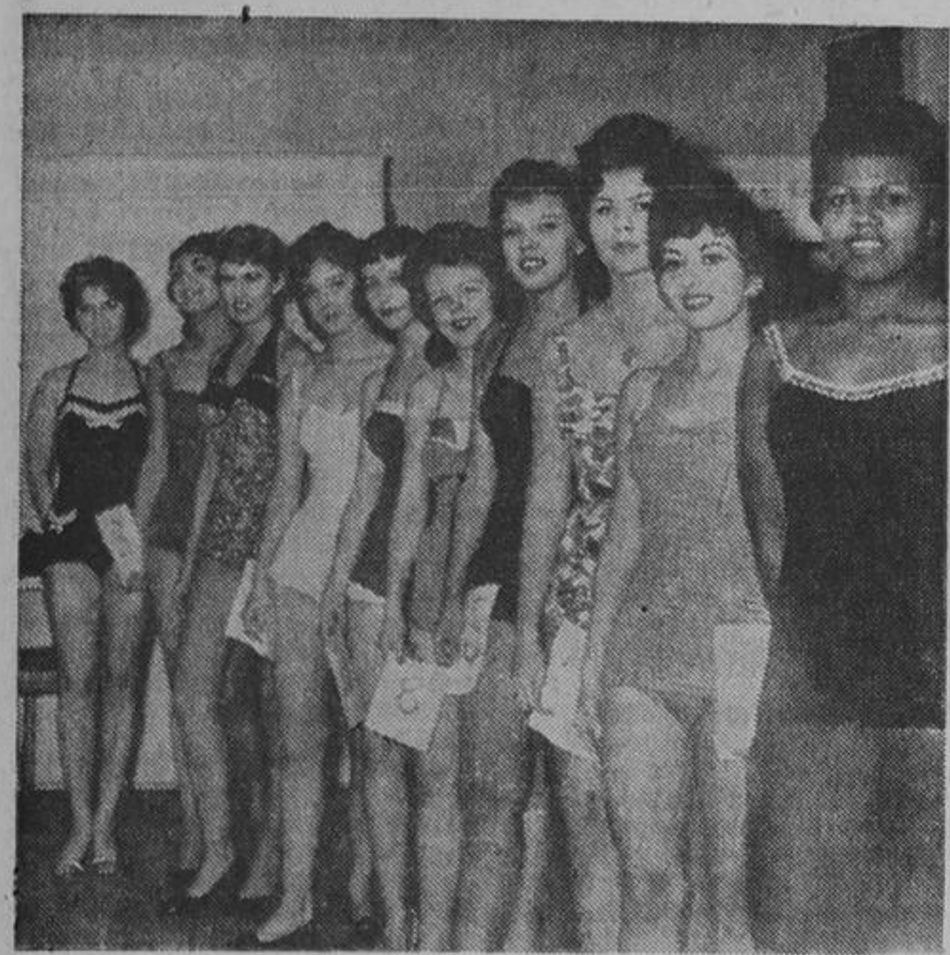
Some of the lovely contestants in last Friday's beauty contest for the title "Miss Bayview" demonstrating Richmond Hill has a full quota of beauty.