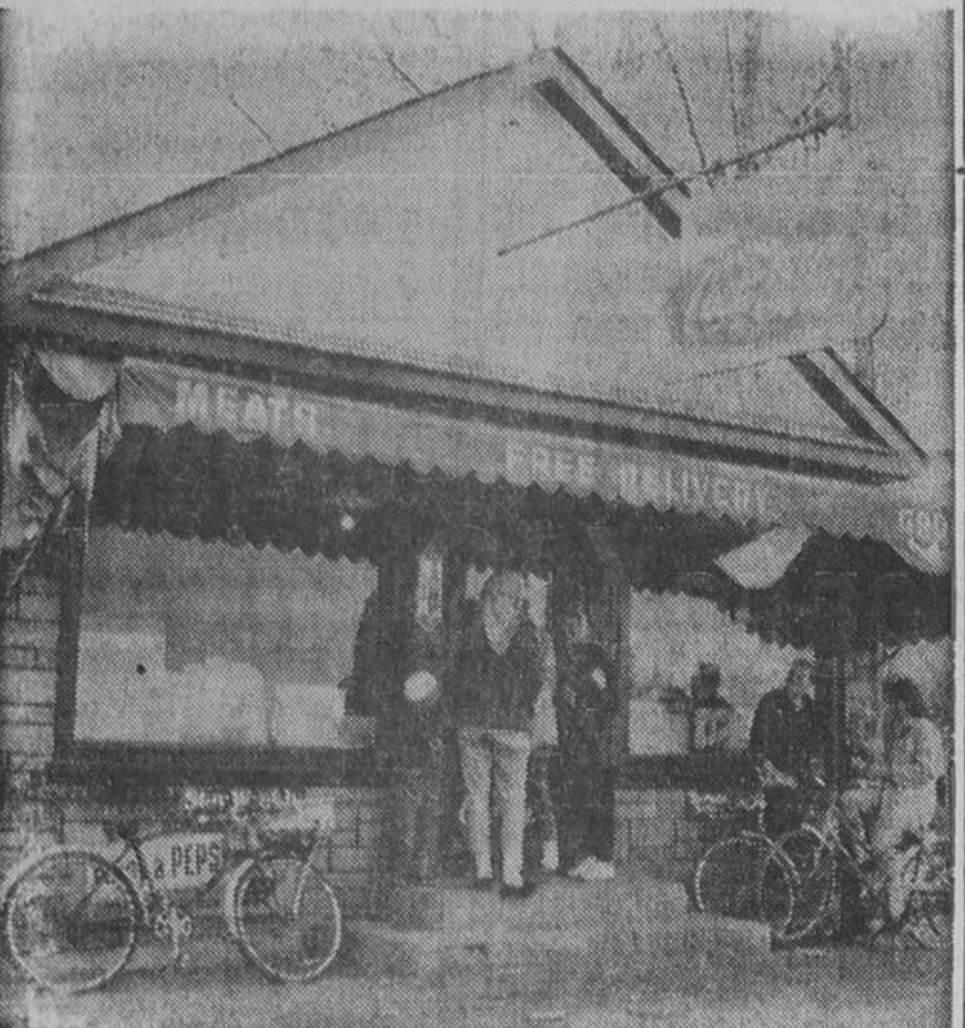
The Costoff grocery on Yonge Street at Yongehurst Road, for many years the very satisfactory site of Yongehurst Post Office.