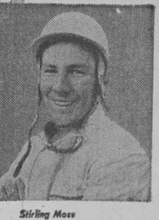
Stirling Moss famous racing driver