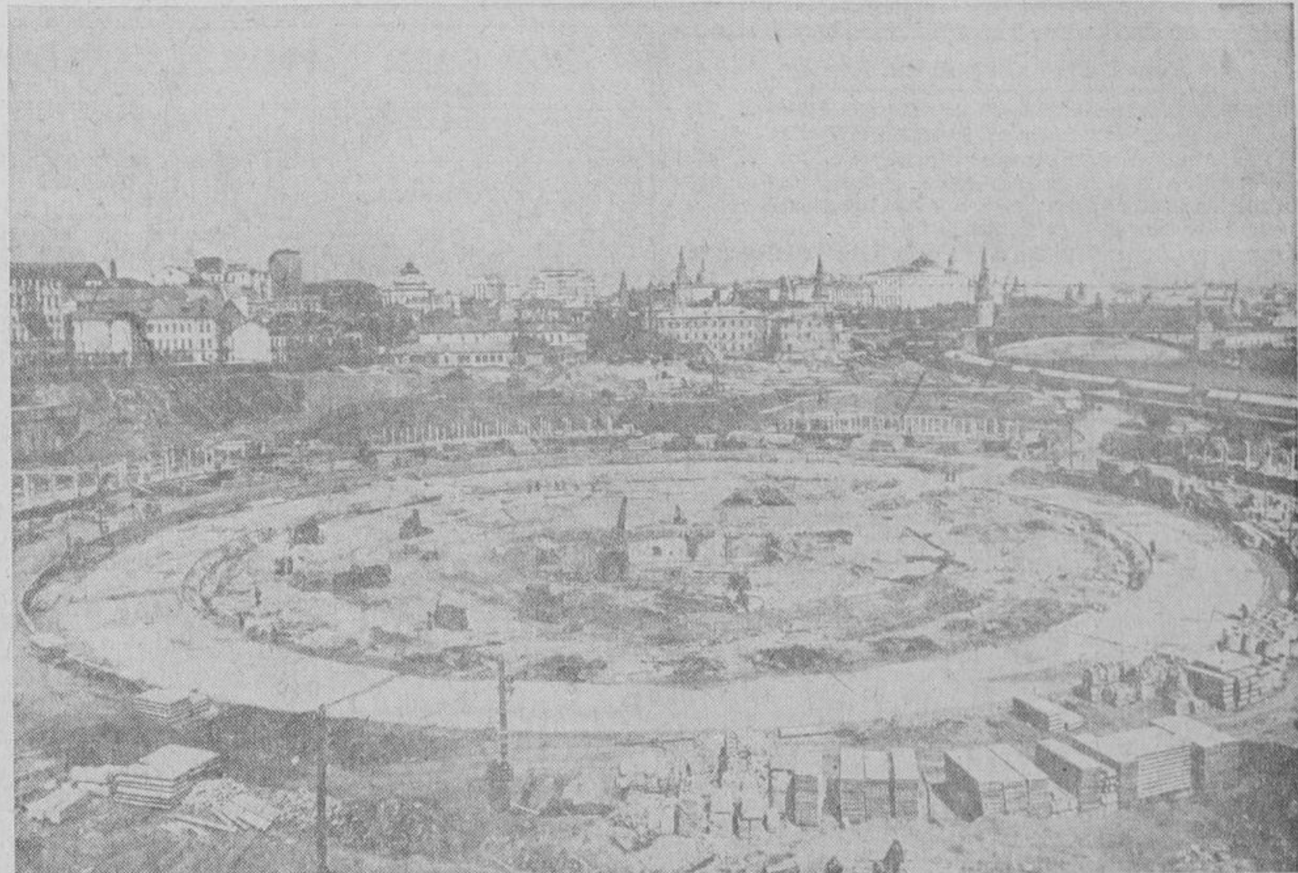
FOR SOVIET SWIMMERS —What the Russians say is the biggest swimming pool in Europe is taking shape in the Kropotkin section of Moscow. Area of the giant Kropotkin pool is three acres.