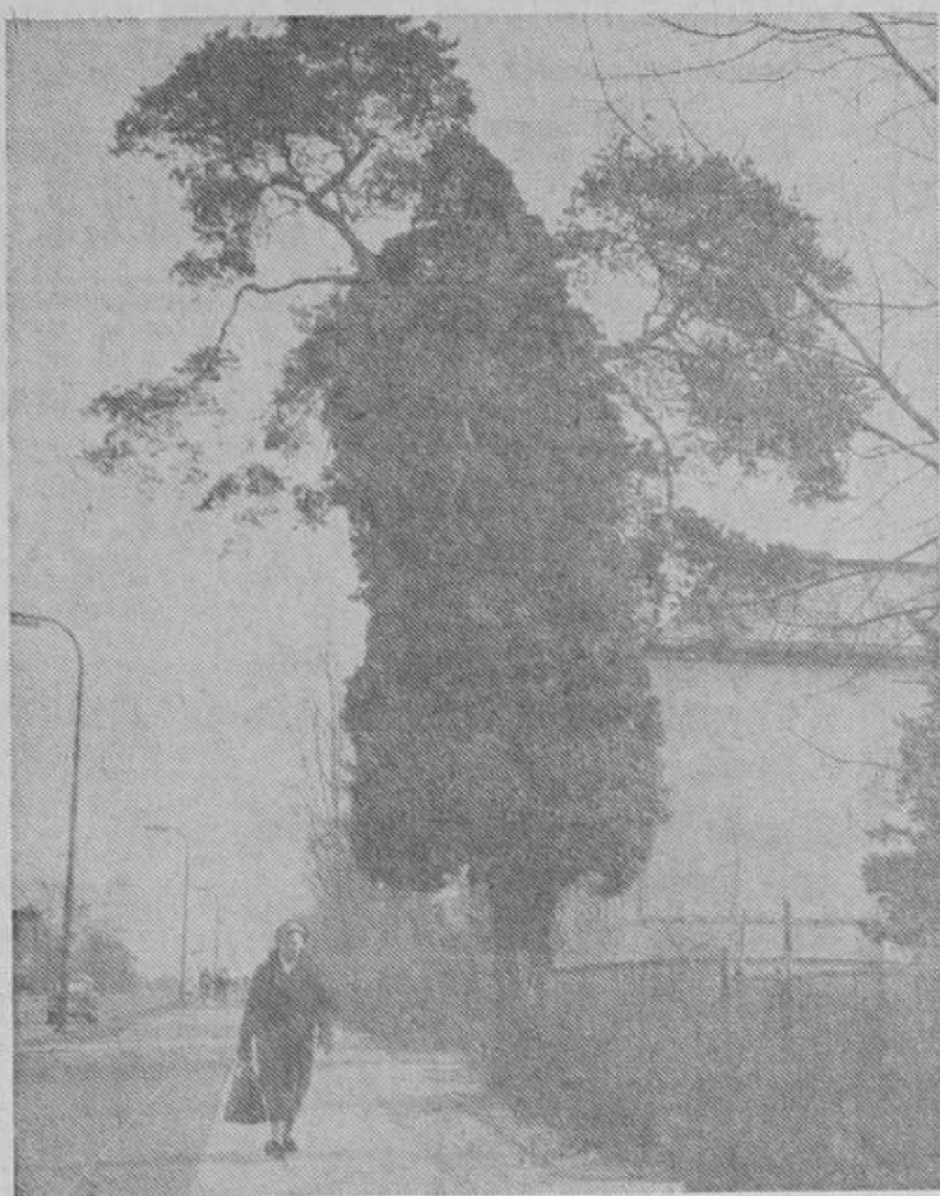
The tree hangs over the sidewalk in front of house.