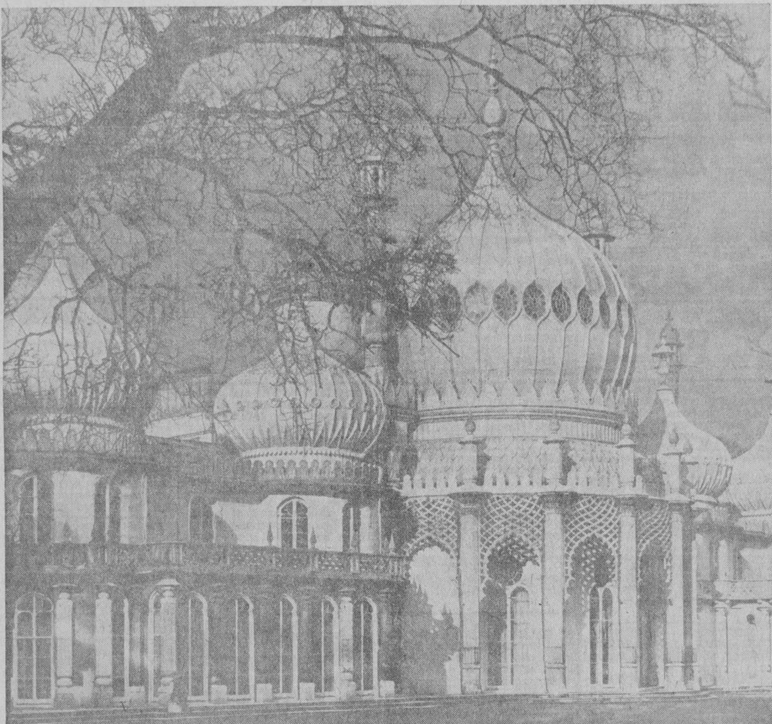
THE ORIENT IN THE WEST —One of the famous sights of the resort of Brighton, in England, is the many-domed oriental tower built by luxury-loving prince regent in the early 19th century. A tourist attraction, it's known as the Pavilion.