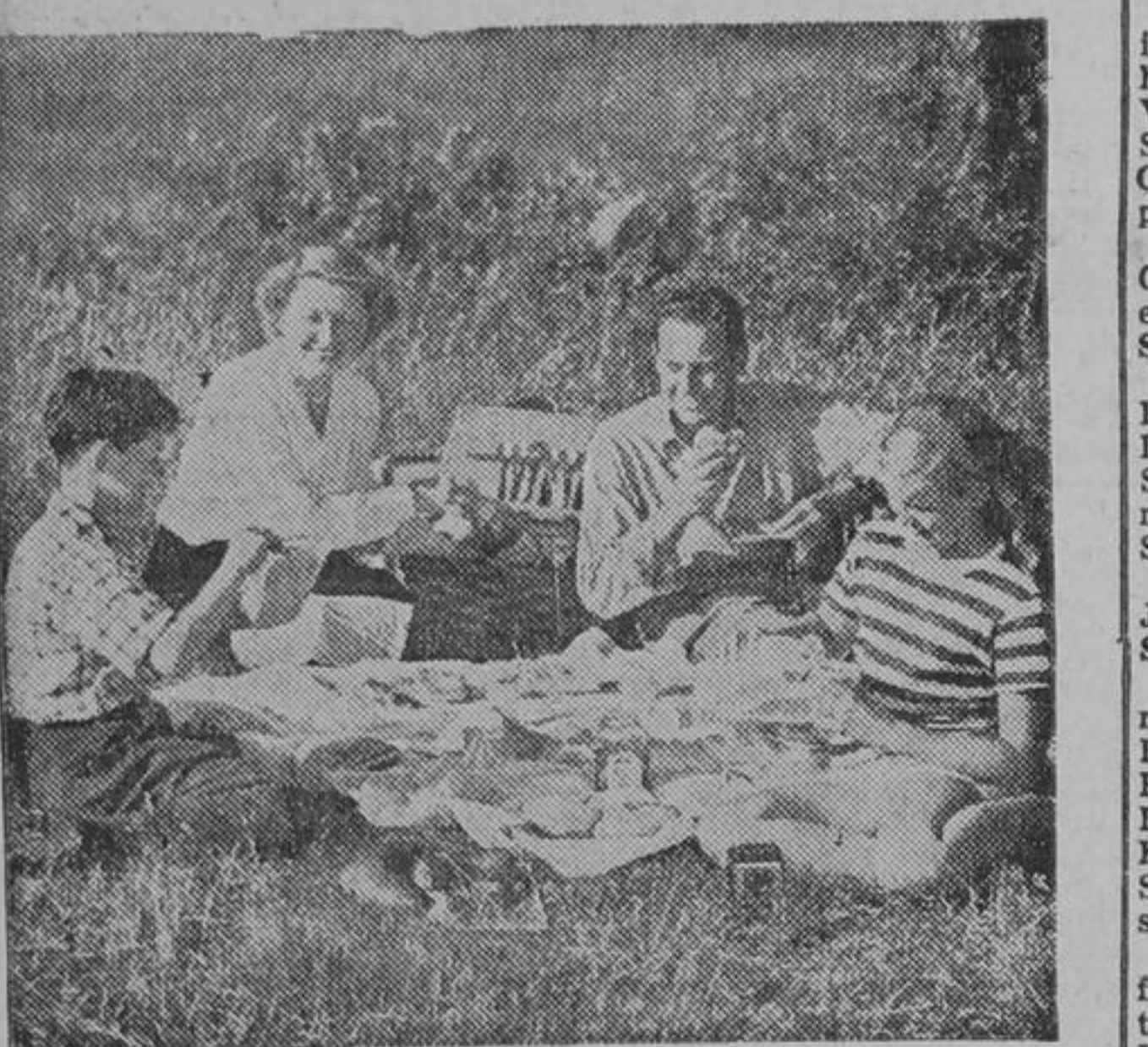
Happiness doesn't just happen. It comes from planning, like this picnic.

Our plan is simple . . . regular saving Our other bank services include: Personal Chequing Accounts, Current Accounts, Safe-keeping, Travellers' Cheques, Letters of Credit, Safety Deposit Boxes, Money Orders, Foreign Remittances, Collections, Banking By Mail.