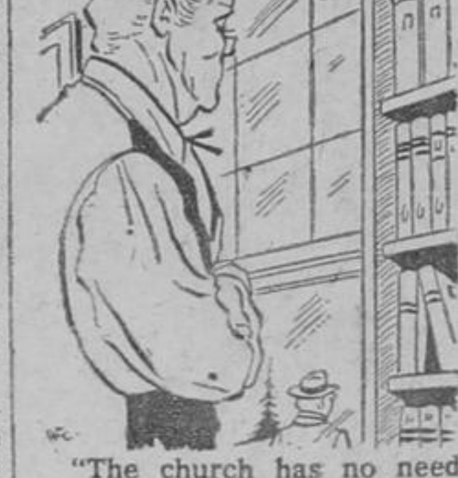
"The church has no need for more members who believe we should leave well enough alone."