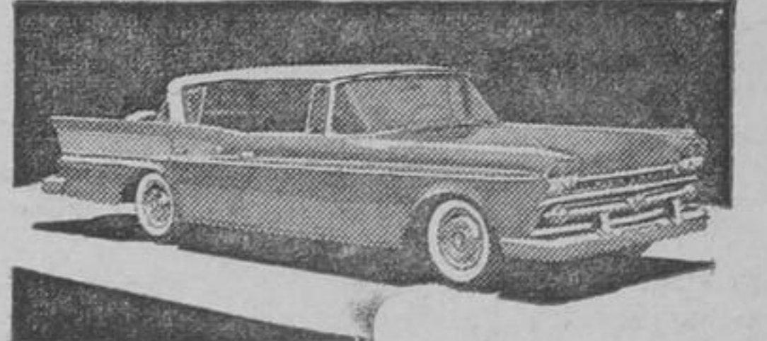
1959 Rambler Ambassador. A 270 horsepower aristocrat with style, beauty, comfort and performance unsurpassed by any other car.