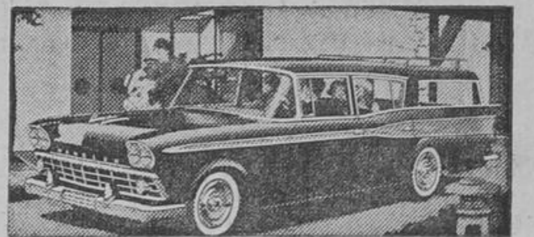
1959 Rambler Custom Cross Country. Most striking wagon on the road. Your choice of Rambler Economy Six or Rebel V8 power.