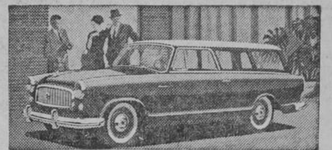
1959 Rambler American Station Wagon. Brand new . . . a roomy, rugged version of the American. Seats five with cargo space to spare.