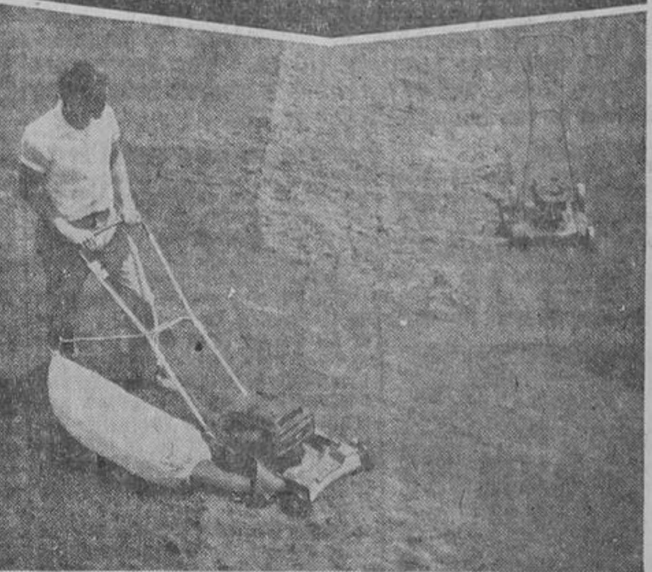
Ordinary mowers clump, skip—leave messy clippings. New Toro cuts evenly, cleans up other clippings as well.