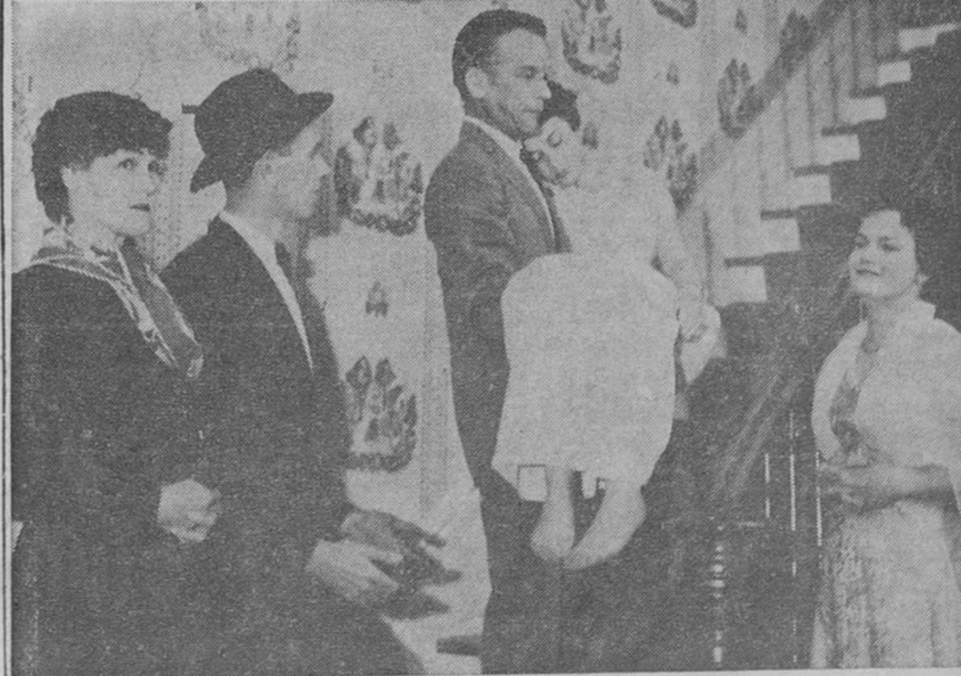
The above scene taken from the Curtain Club's Spring production "KIND LADY" shows the confidence man's sick wife being carried upstairs by the doctor. The only trouble is that he is not a doctor, she is not a wife, and neither is she sick. For a solution to this mix-up, see the play at the Lions Hall on April 9th, 10th, or 11th.