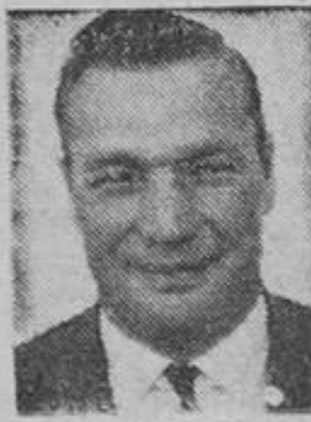
GEO. BOOTH Sales Staff