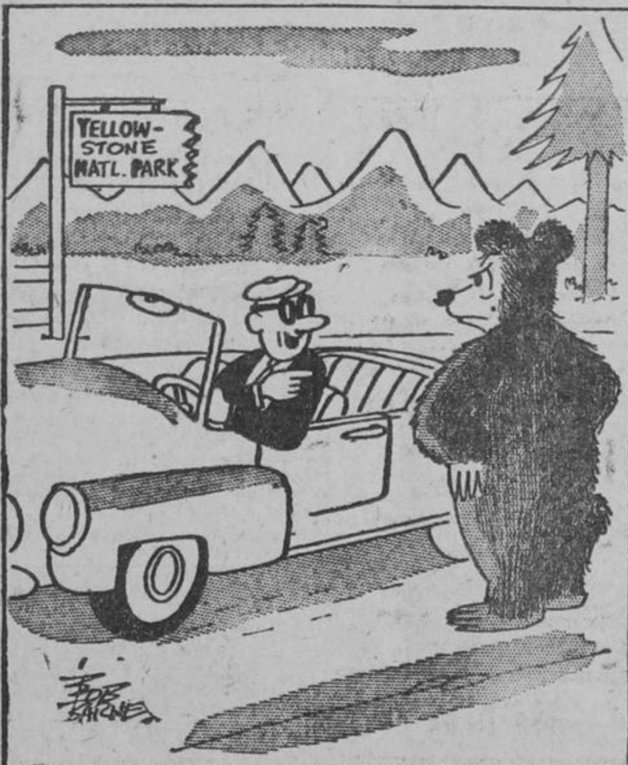
"Toss your fur coat in the back seat and hop in, Mac—I'm going as far as Casper."