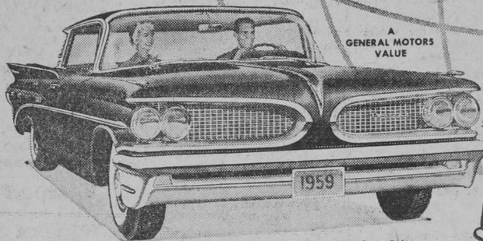
PARISIENNE VISTA 4-Door Sport Sedan

The rich, rich world of Pontiac wonders!