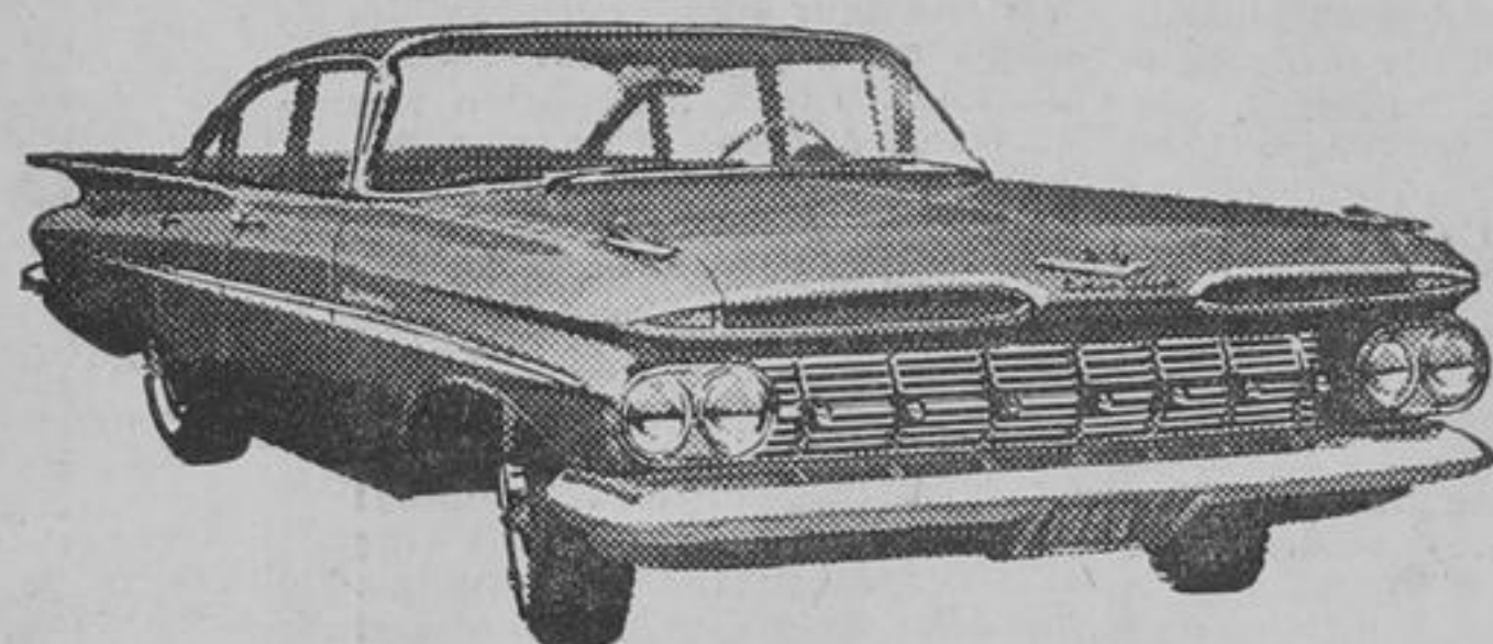
Bel Air 4-Door Sedan — new sight down to its tires.

There's still more! A new Magic-Mirror finish that keeps its shine without waxing or polishing for up to three years. New Impala models. Wonderful new station wagons — including one with a rear-facing rear seat. And, with all that's new, you find those fine Chevrolet virtues of economy and practicality. Stop in now and see the '59 Chevrolet. *Extra-cost option.