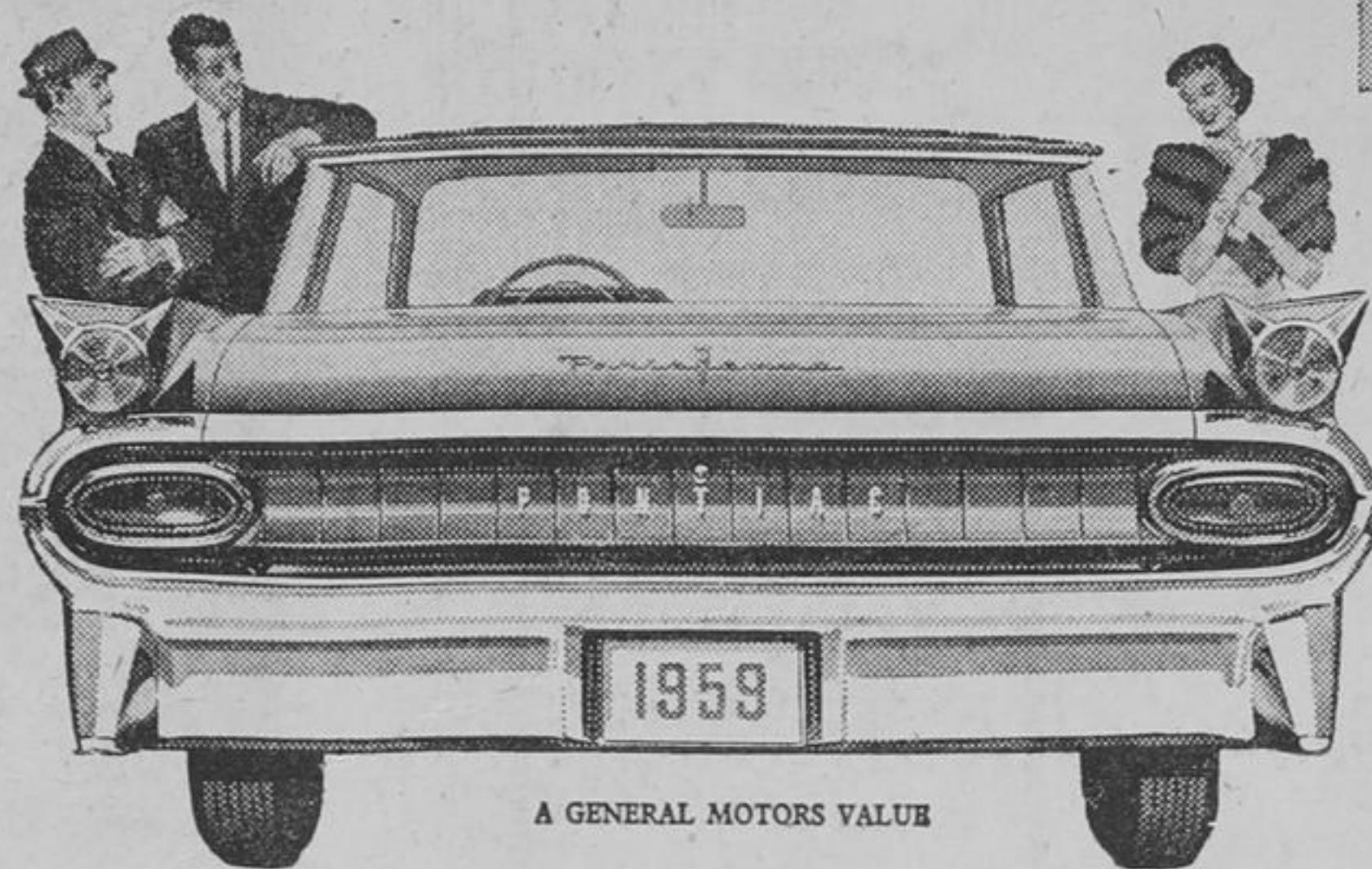
A GENERAL MOTORS VALUE

Look what's happened to Pontiac—the biggest change any car ever made in a single year! Pontiac's put your future on wheels with dramatic styling and engineering advances that defy comparison. Yes, Pontiac's had a change of personality, starting with its glamorous Twin-Grille design and ending with the most smartly sculptured rear deck you've ever seen. Lean in look, this new Pontiac's longer, lower, too, for the surest, most stable roadability ever. But there's still more to the new Pontiac to stamp it as the big change for '59 and make your first inspection a truly revealing experience. Come in and see why no other car can possibly be so new as the new Pontiac.