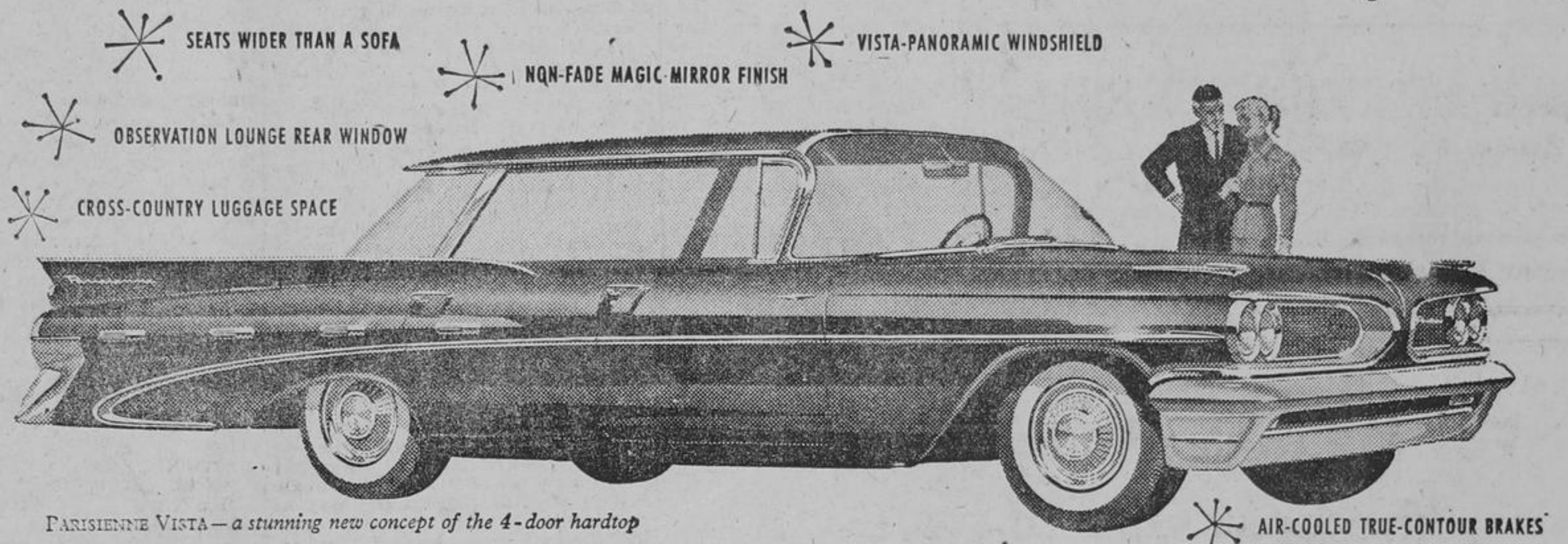
PARISIENNE VISTA—a stunning new concept of the 4-door hardtop