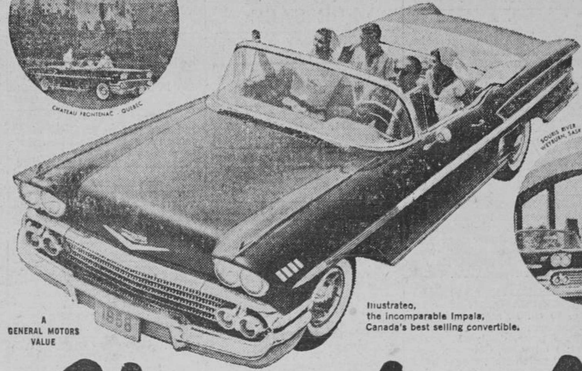
Illustrated, the incomparable Impala, Canada's best selling convertible.