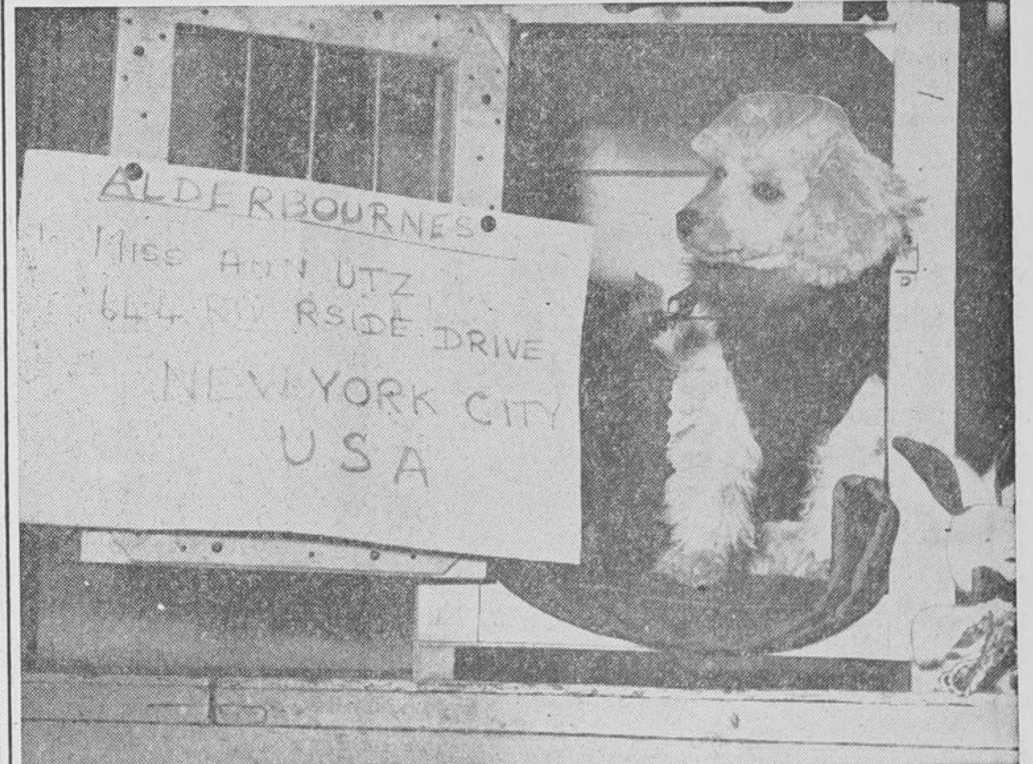
A woman in New York City will get this "little chap" who is about to take off.

PATRIOTIC POOCHES are helping to improve Britain's financial status by bringing in American dollars. Alderbornes, a small shop on London's west side, deals exclusively in miniature dogs and Americans are the favorite customers. The dog shop will ship by air to any part of the world and throw in food and a blanket in the travel equipment. "Little chaps," as Alderbornes calls its miniatures, have found welcome homes abroad. Alderbornes also supplies all kinds of doggy wear, from a knit sweater to one made of mink. Business is fine.