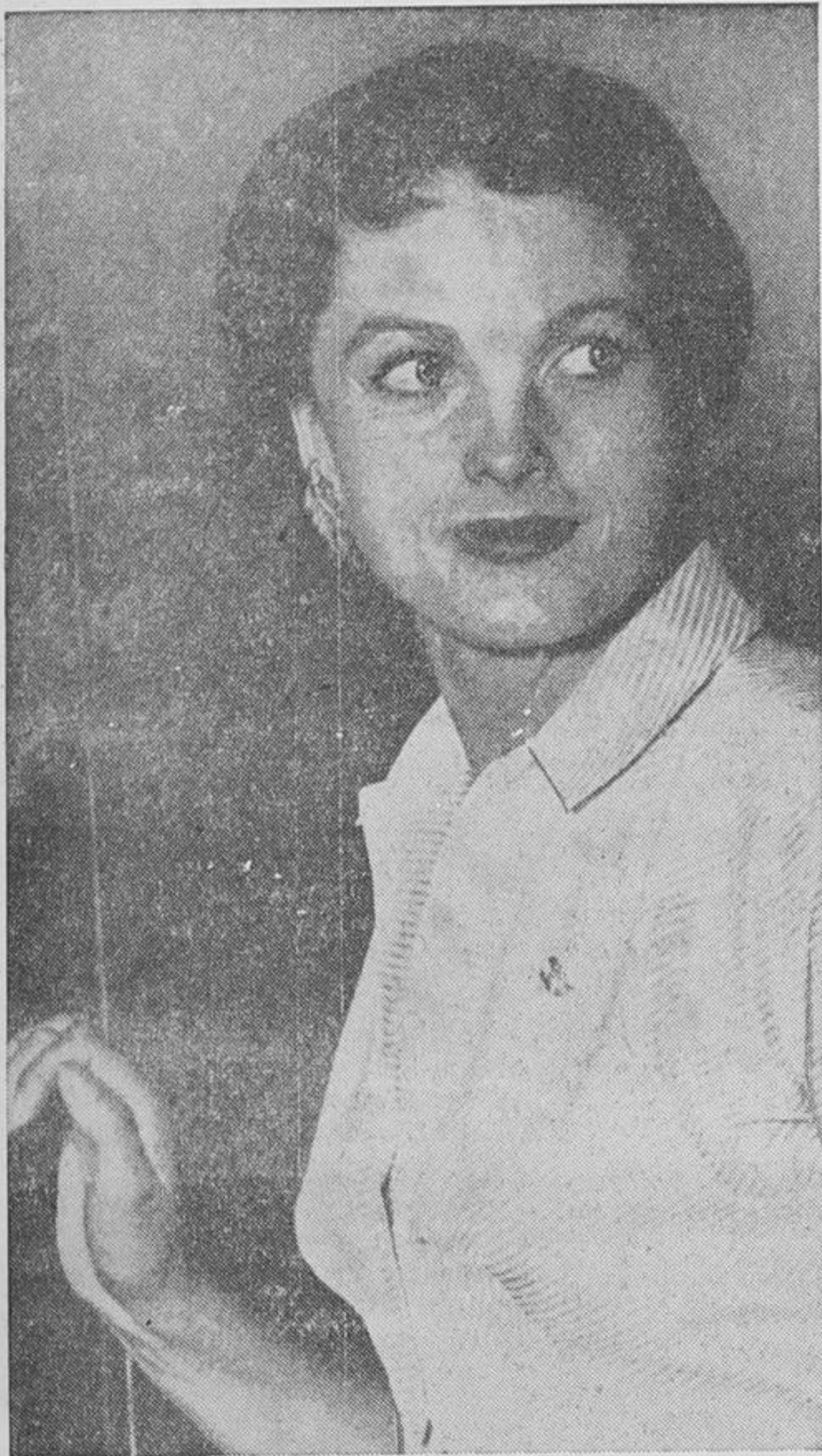
AMERICAN DEBUT —Actress Ursula Theiss, wife of movie star Robert Taylor, comes to a Los Angeles court to receive her final naturalization papers.