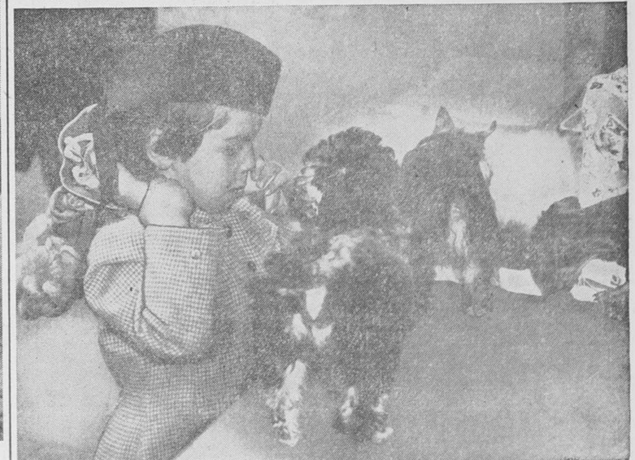
This miss, with her dolly wrapped around her neck, decides which dog to take.