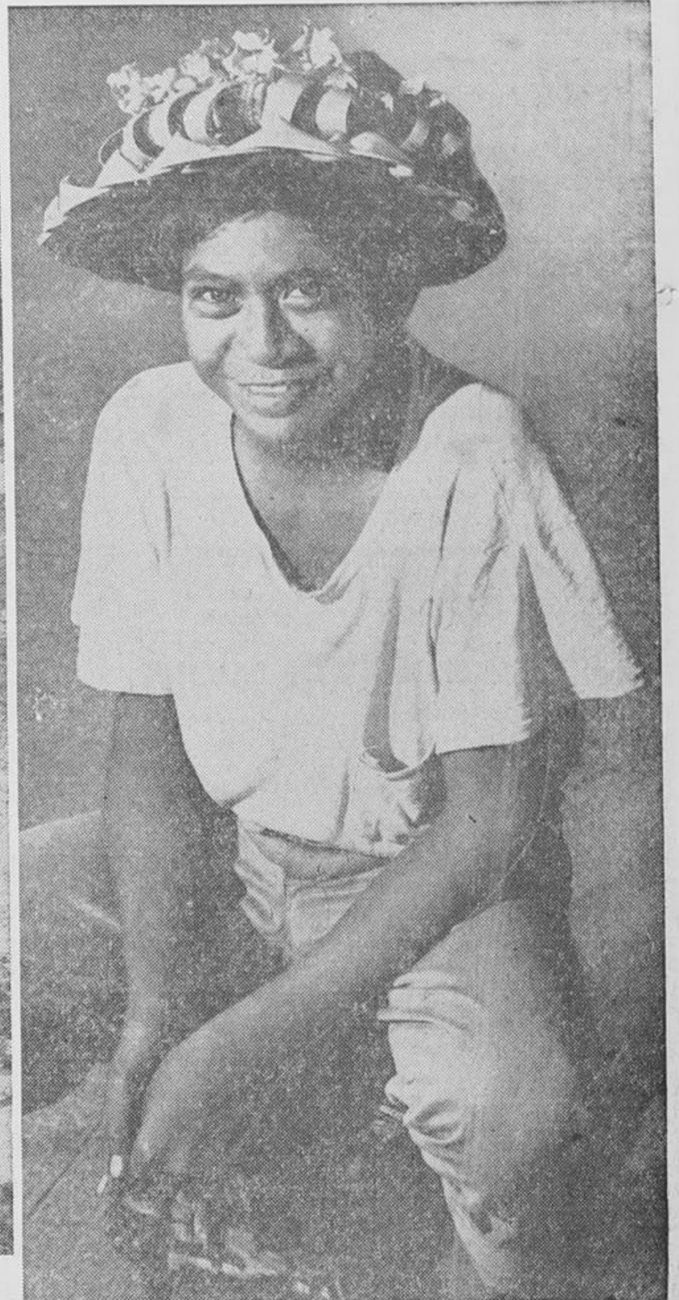
NO ADVERTISEMENT —This shoe shine boy on the island of Maui doesn't believe in advertising his services, evidently, as he doesn't wear any shoes himself. However, he does a brisk business. Note the coconut hat with the flower band of orchids.