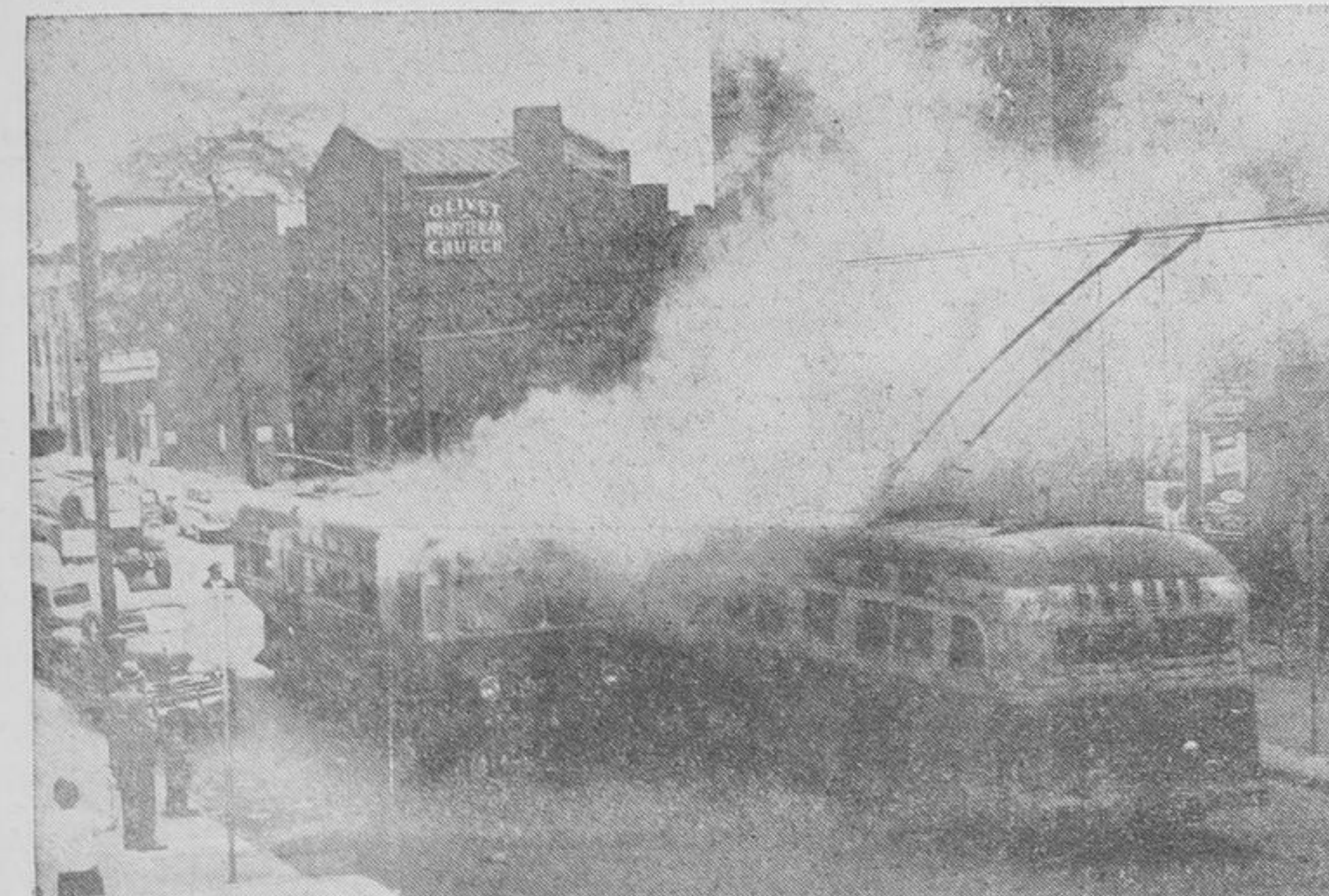
RAPID-FIRE EXIT —Passengers "made tracks" in leaving this smoking bus in Brooklyn. As firemen battle the blaze, passengers (left) wonder what caused it.