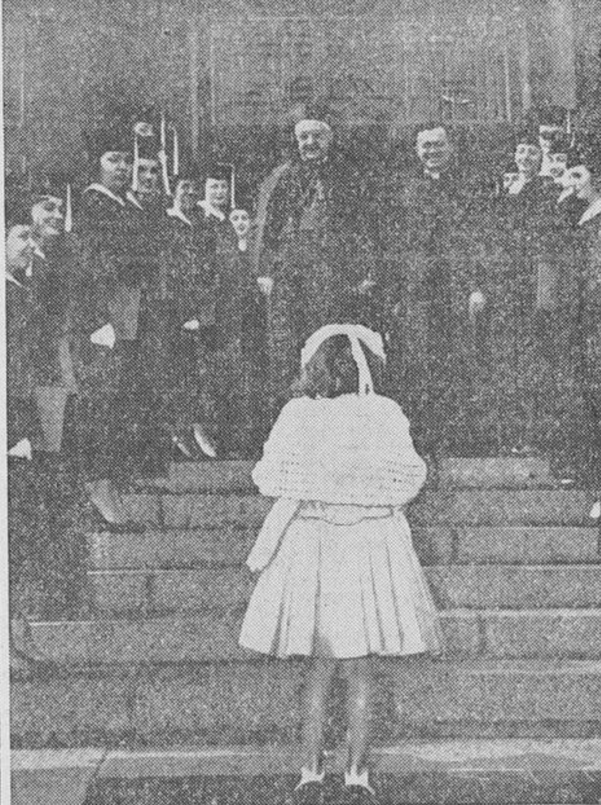
CARDINAL'S 'FAN' —A young girl "crashes" the line at Mundelein college, Chicago, to get a picture of His Eminence Samuel Cardinal Stritch (left). The prelate's honor guard smiled along with him at the unexpected interlude at the college's commencement.