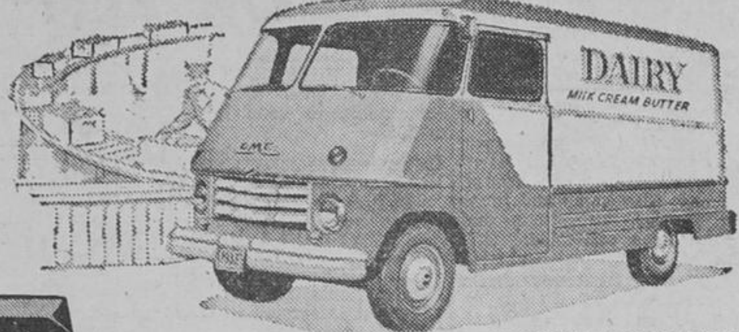
A GENERAL MOTORS VALUE Brand new '58, styling GMC Forward-Control Utility Vans with their spanning fresh, these create just the right impression for your product... come in a choice of wheelbases for king-size economy and capacity.