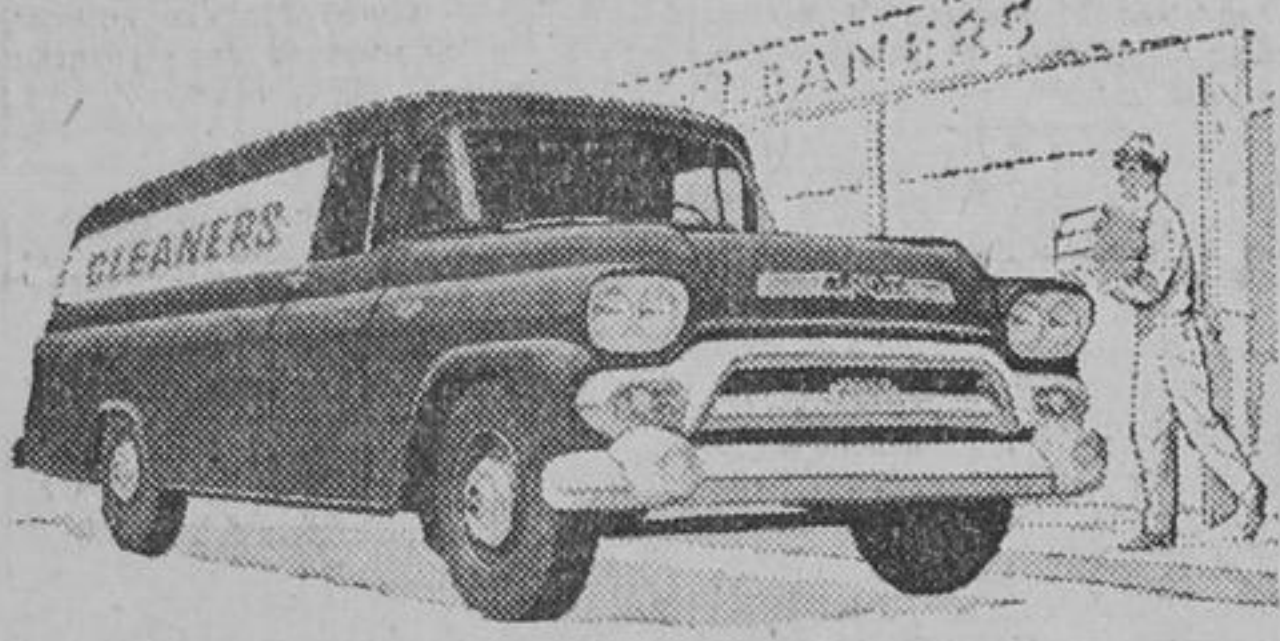
GMC's are just great for spreading the good word about your business. Take this GMC panel, for instance. Its smart, functional appearance builds up public confidence wherever it goes.