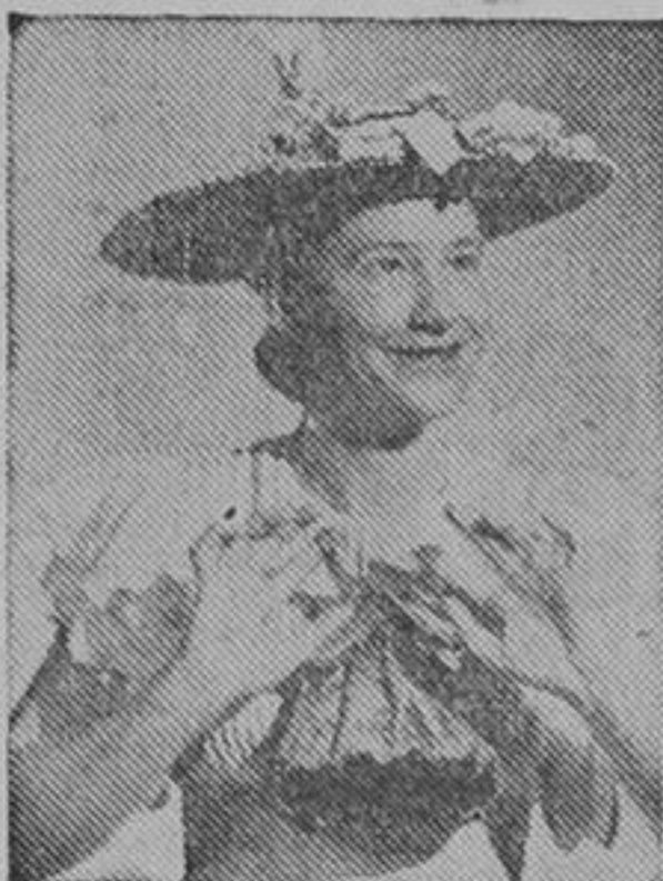
MINNIE PEARL Grand Ole Opry favorite, and one of the funniest.