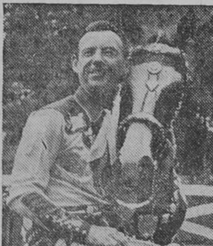
HANK SNOW "Western" singing star of stage, screen and radio, with his Rainbow Ranch Boys.