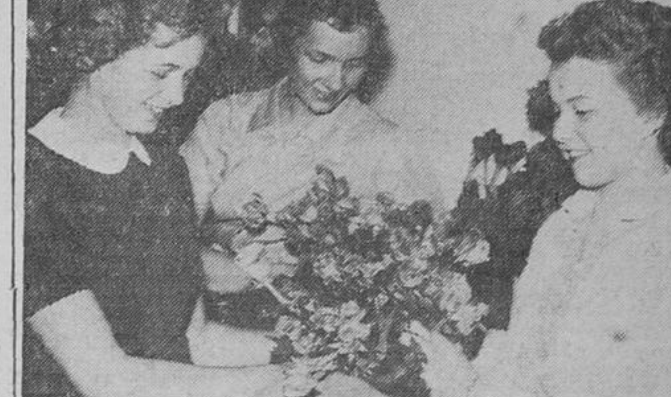
Three charming young ladies are seen above preparing for the annual Rose Petal Prom sponsored by Richmond Hill Teen Town. This social event which marks the highlight of the teen town season will be held this Friday evening at the Lions Hall.

The purpose of this county meeting was to arrange for the fourth annual convention to take place in November of this year; it will probably be held in Thornhill.