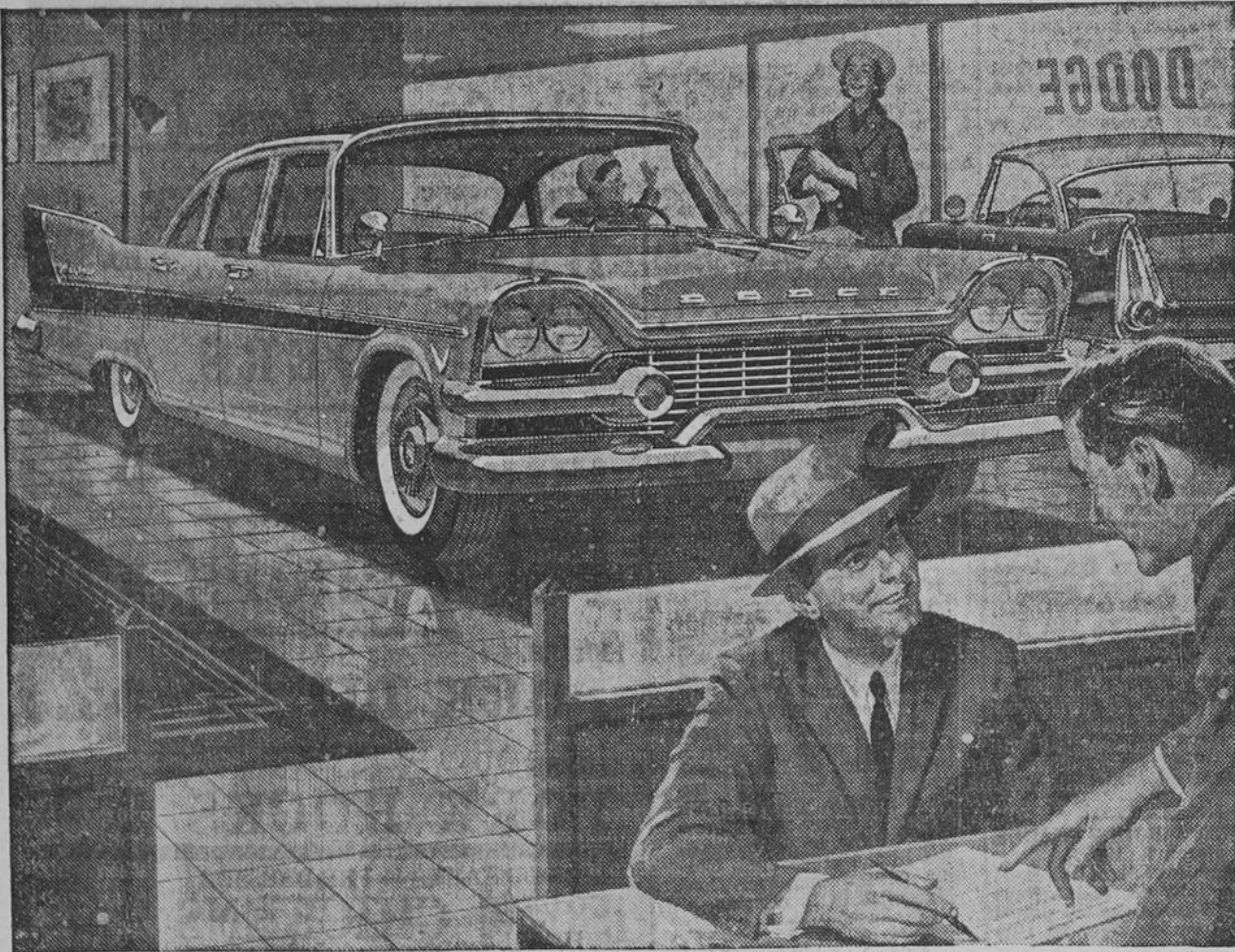
You're looking at another delighted Dodge family . . . this one beaming over their stunning new Mayfair 4-door sedan

BIG, BOLD, BEAUTIFUL...and low-priced, too!