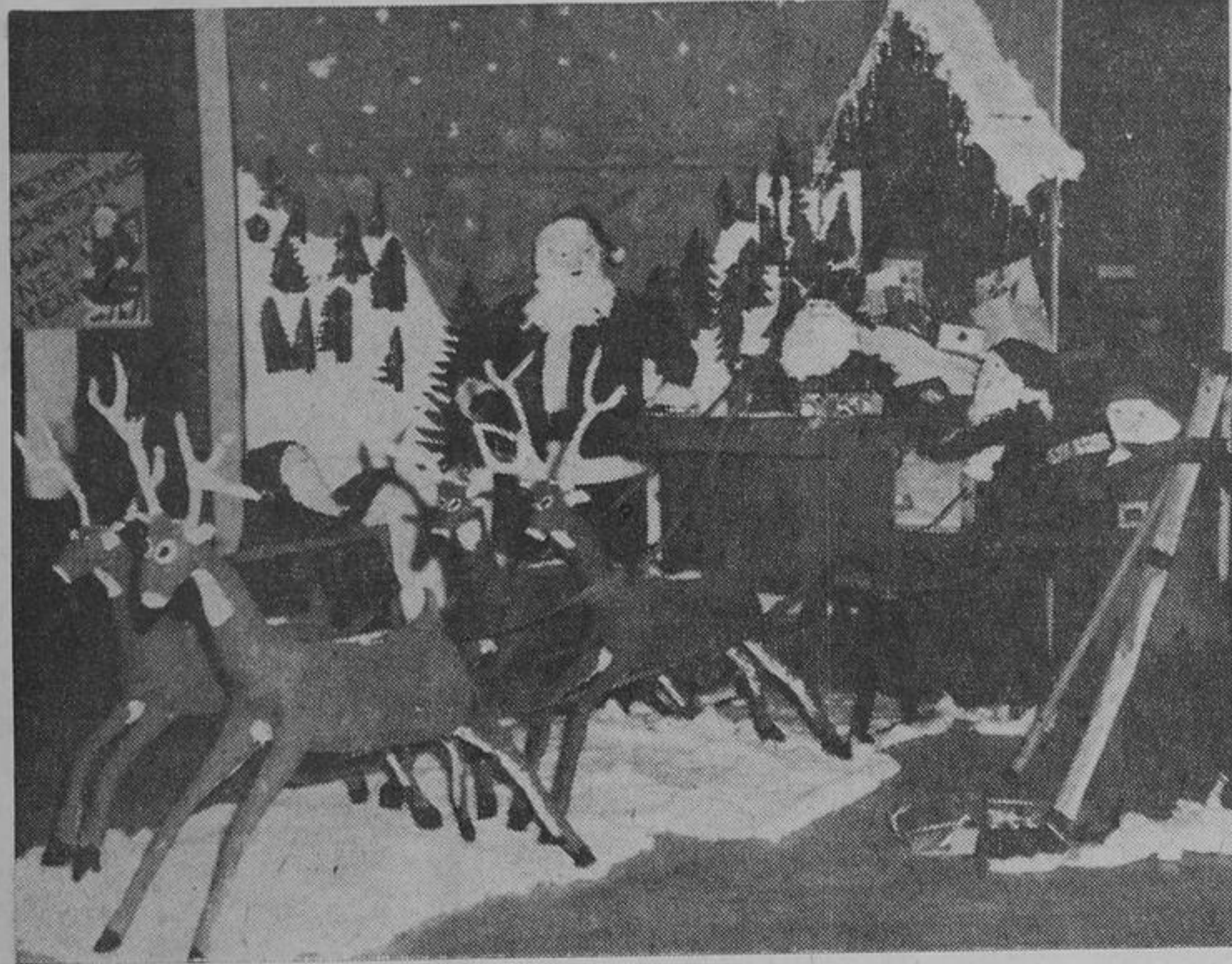
"Santa Claus' Workshop" is a very creditable creation by the pupils and teachers of the MacKillop Public School, Richmond Hill, symbolizing one traditional and very popular event of the Christmas season. Backed by a twelve foot square illuminated background showing the doorway, the hills, trees and the sky, all in perspective, this scene depicts Santa starting from the North Pole, three little elves loading the gift parcels on to the sleigh, with the fourth elf holding the reins of the reindeer.