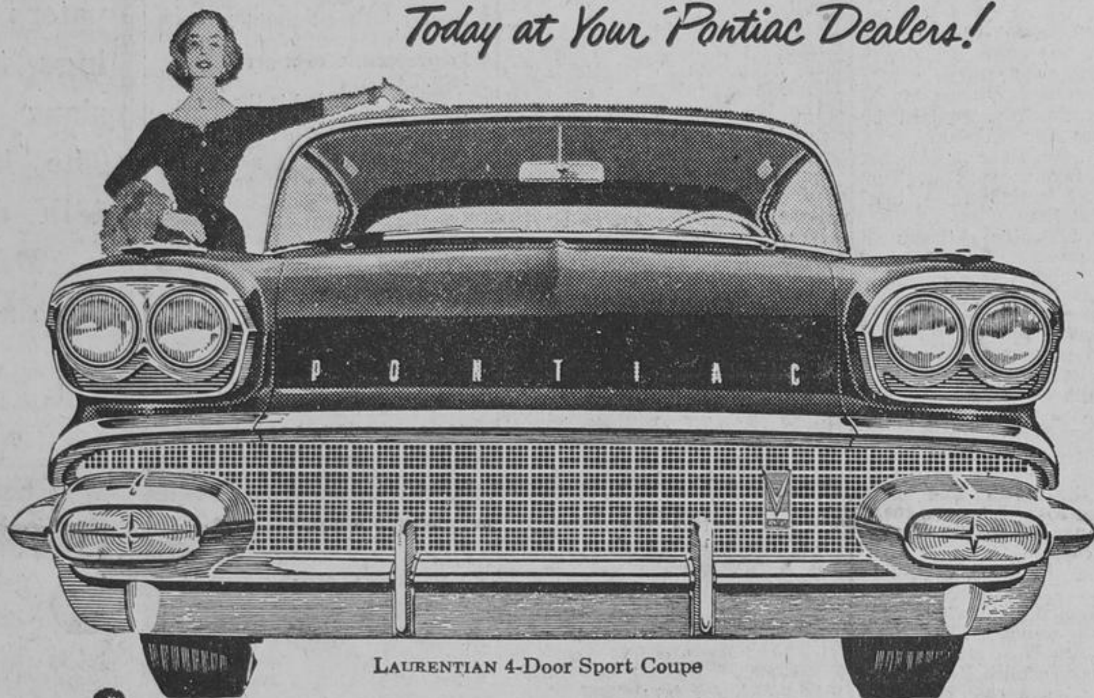
LAURENTIAN 4-Door Sport Coupe