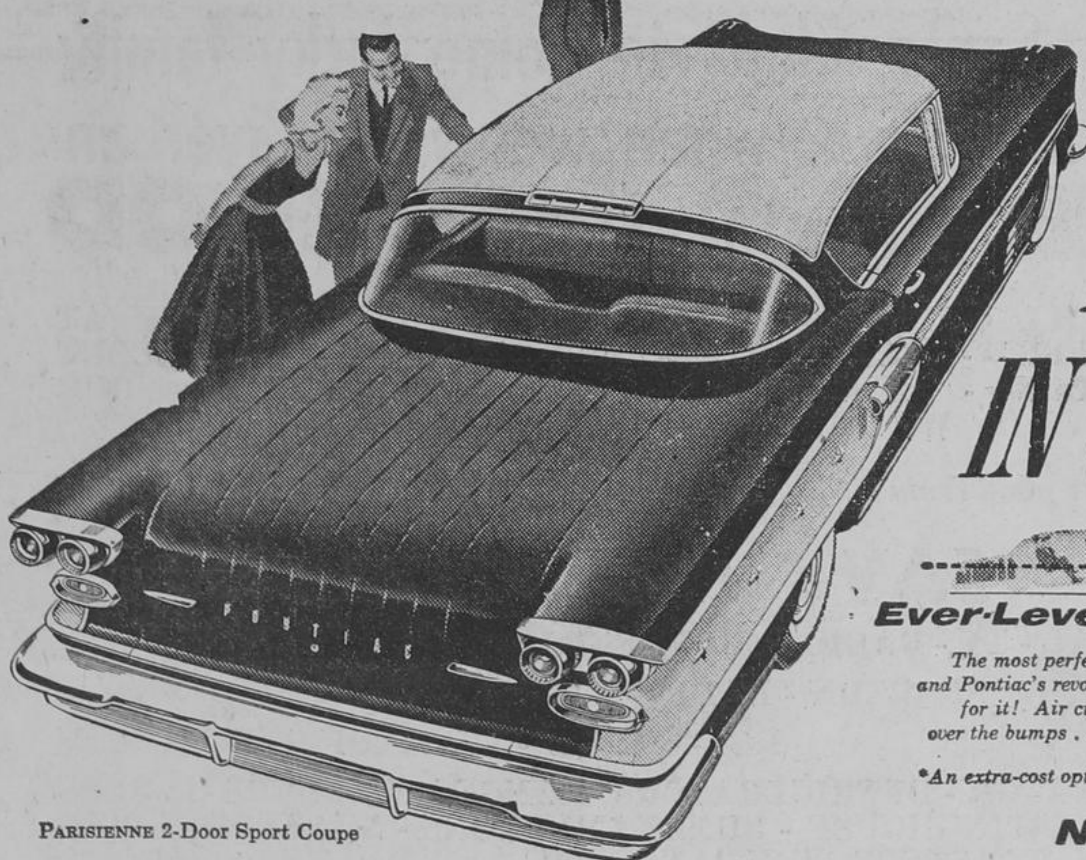
PARISIENNE 2-Door Sport Coupe