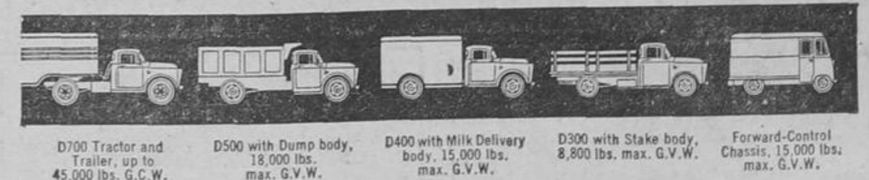
D700 Tractor and Trailer, up to 45,000 lbs. G.C.W. D500 with Dump body, 18,000 lbs. max. G.V.W. D400 with Milk Delivery body, 15,000 lbs. max. G.V.W. D300 with Stake Body, 8,800 lbs. max. G.V.W. Forward-Control Chassis, 15,000 lbs. max. G.V.W.

From 4,250 lbs. G.V.W. to 65,000 lbs. G.C.W. . . . the high-styled choice for all your hauling needs.