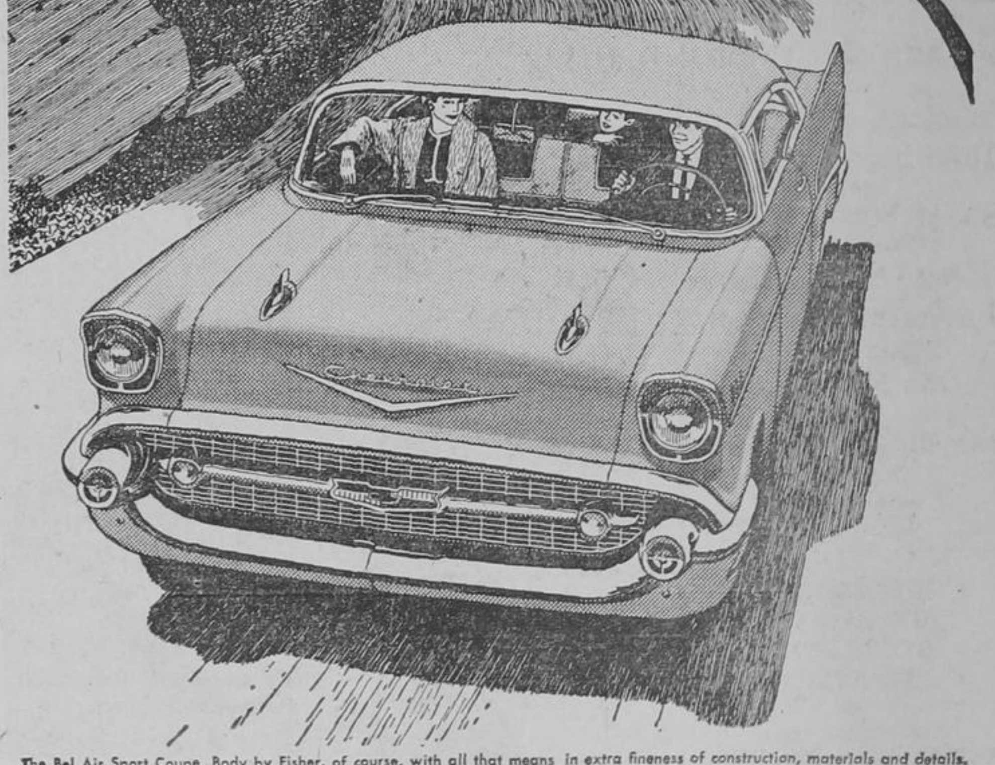
The Bel Air Sport Coupe. Body by Fisher, of course, with all that means in extra fineness of construction, materials and details.