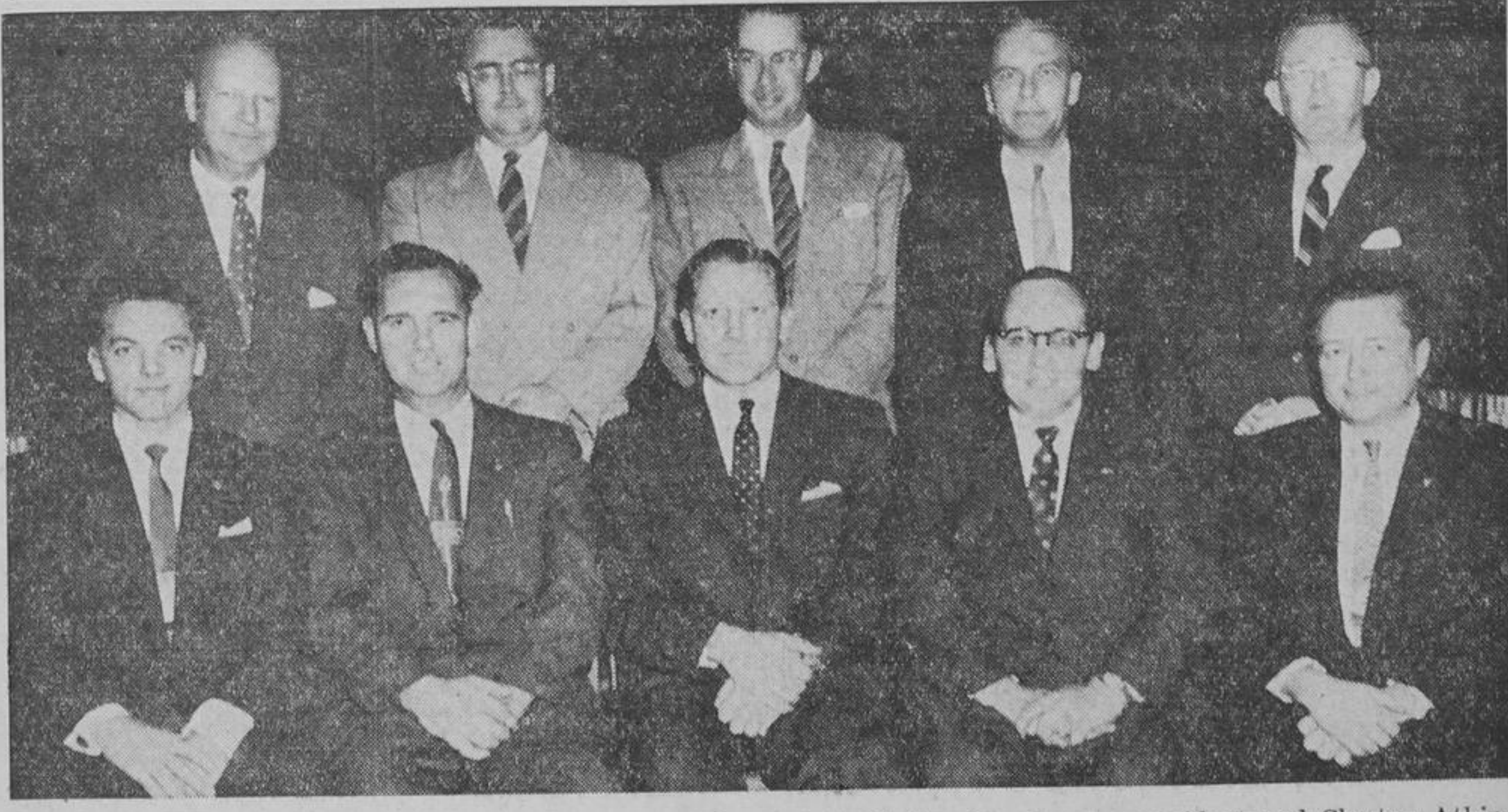
Shown above are the executive officers responsible for guiding the destinies of the Thornhill Lions Club during the 1956-57 club year. Composed of energetic local men dedicated to the well being of their community the members are active in the life of the village and surrounding areas.