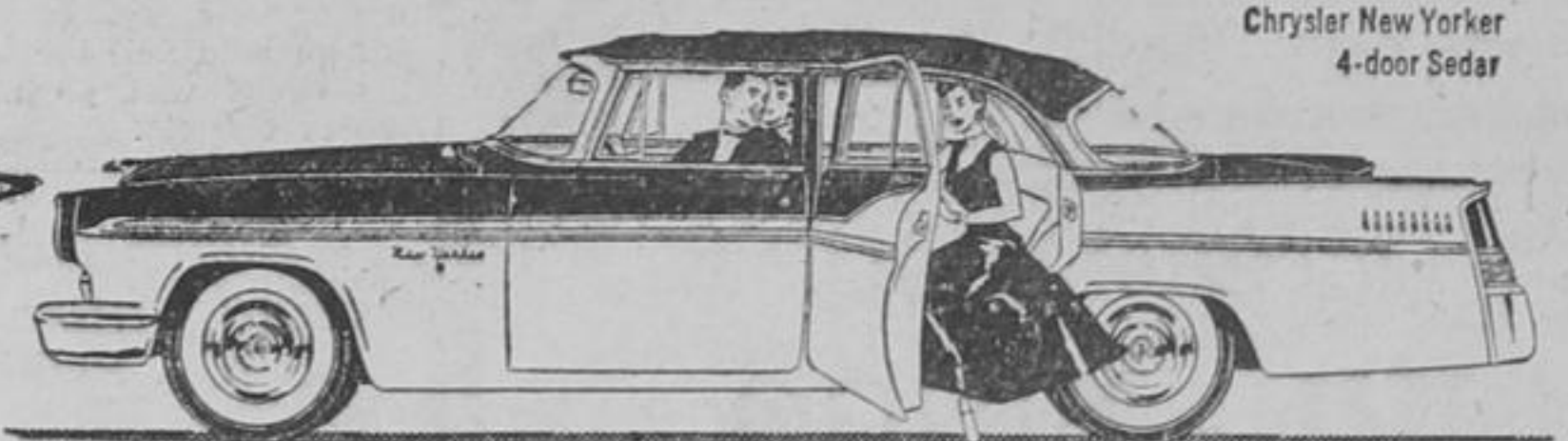
Chrysler New Yorker 4-door Sedan

See Chrysler... finest of the Forward Look... at your dealer's now