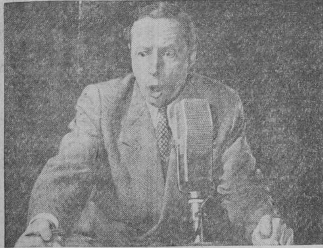
CANADA'S MISTER HOCKEY

Thornhill Midgets will hold an organizational meeting this Friday night, November 11 at 7.30 p.m. at Trinity Anglican Church. All boys between the ages of 14-16 as of October 1, 1955, are welcome. Season's passes for the games will be sold again this year. The lucky draw on these tickets which will be held next month, will be for a $50. prize.