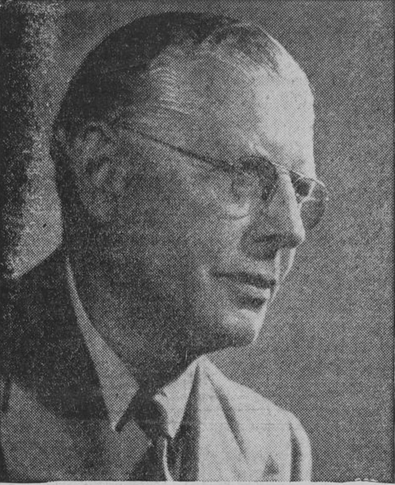
LESLIE M. FROST, Prime Minister of Ontario