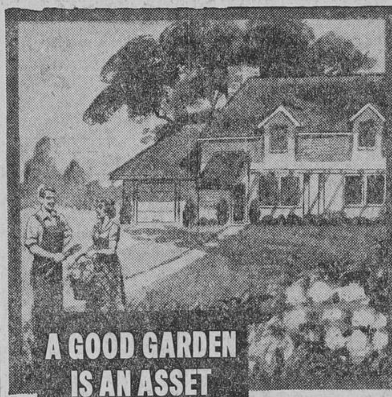
A GOOD GARDEN IS AN ASSET

John C. Love Lumber Company, Ltd. Yonge Street at Woodward Avenue (Just North of Steele's Corners) Thornhill, Ont. Avenue 5-1143