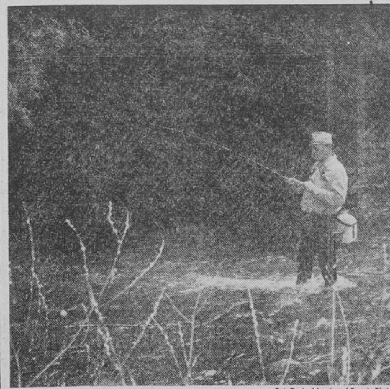
EARLY SPRING FISHING attracts thousands to Ontario's well-stocked streams. Scene is Nottawasaga River in Georgian Bay district.