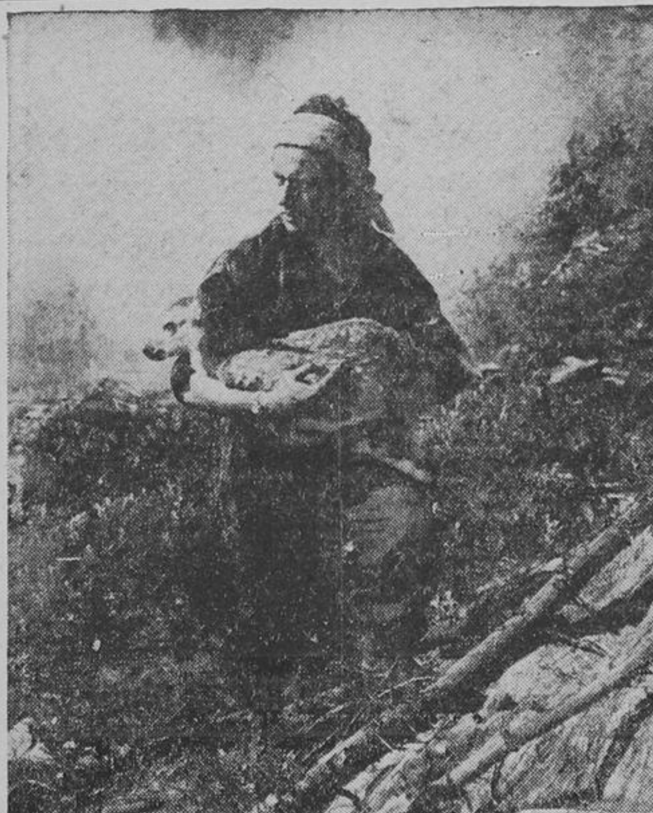
FOREST FIRE FIGHTER RESCUES FAWN—Fish and wildlife as well as forest wealth and beauty spots all suffer when fire engulfs Ontario woodlands. April 1 to October 31, official forest fire season, is time of highest hazard. Be careful, everybody!