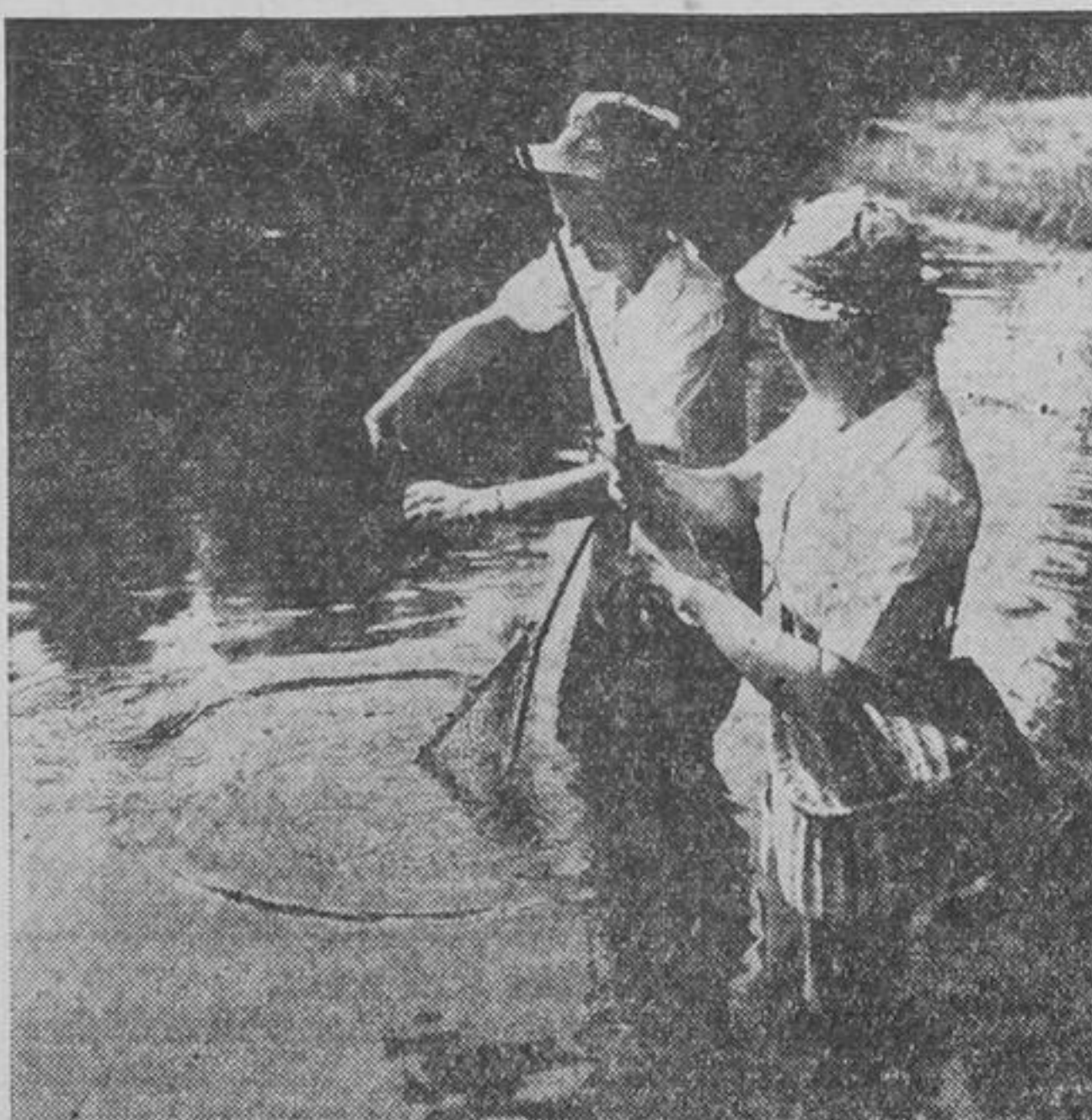
GIRLS LAND TROUT LIKE EXPERTS in Sault Ste. Marie District, Ontario. Season for speckled opens Saturday, April 30, instead of usual May 1 which, this year, falls on Sunday.

NORTH YORK — The Township School Board has set its 1955 budget for public and secondary schools at $6,429,000. This is a rate of 9.17 mills for public schools and 2.28 for secondary schools, an overall increase of 1.95 mills over last year. It is expected that in '55 the board will be operating a total of 851 class-rooms staffed by 1007 teachers.