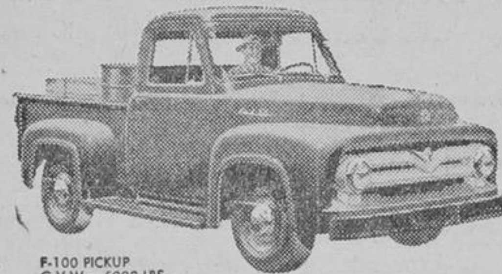
F-100 PICKUP G.V.W.—5000 LBS. PAYLOAD—UP TO 1618 LBS.

Over 125 models... G.V.W.'s up to 40,000 lbs... extended range of spring, axle and tire options. In every series, from half-tonners to giant "Big Jobs", Ford offers you high payload capacities. For example, the new F-100 Pickup now has payload capacity up to 1618 lbs. Gross Vehicle Weights range from 5000 lbs. to 40,000 lbs.—Gross Combination Weights go right up to 60,000 lbs. Axle and spring capacities have been increased.