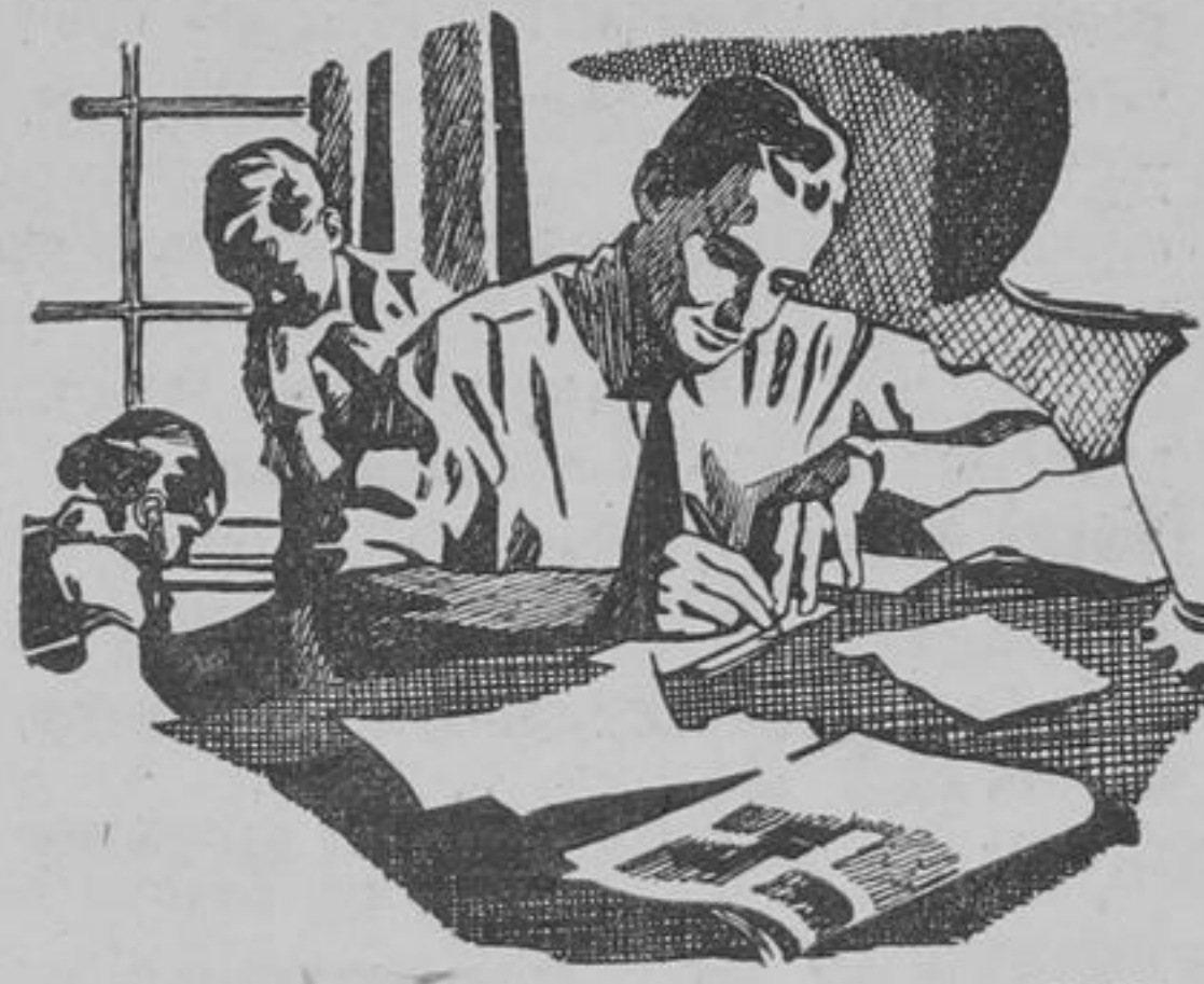
If you write cheques frequently, you will like the many advantages of a Current account.

The money you leave in a Savings account earns interest, and your bank book gives you an up-to-date, continuing record of your financial progress. If your funds are active, with frequent deposits and withdrawals, a Current account provides a special service; a monthly statement, together with your cancelled cheques—useful as receipts and a ready reference for budgeting, bookkeeping and other purposes.