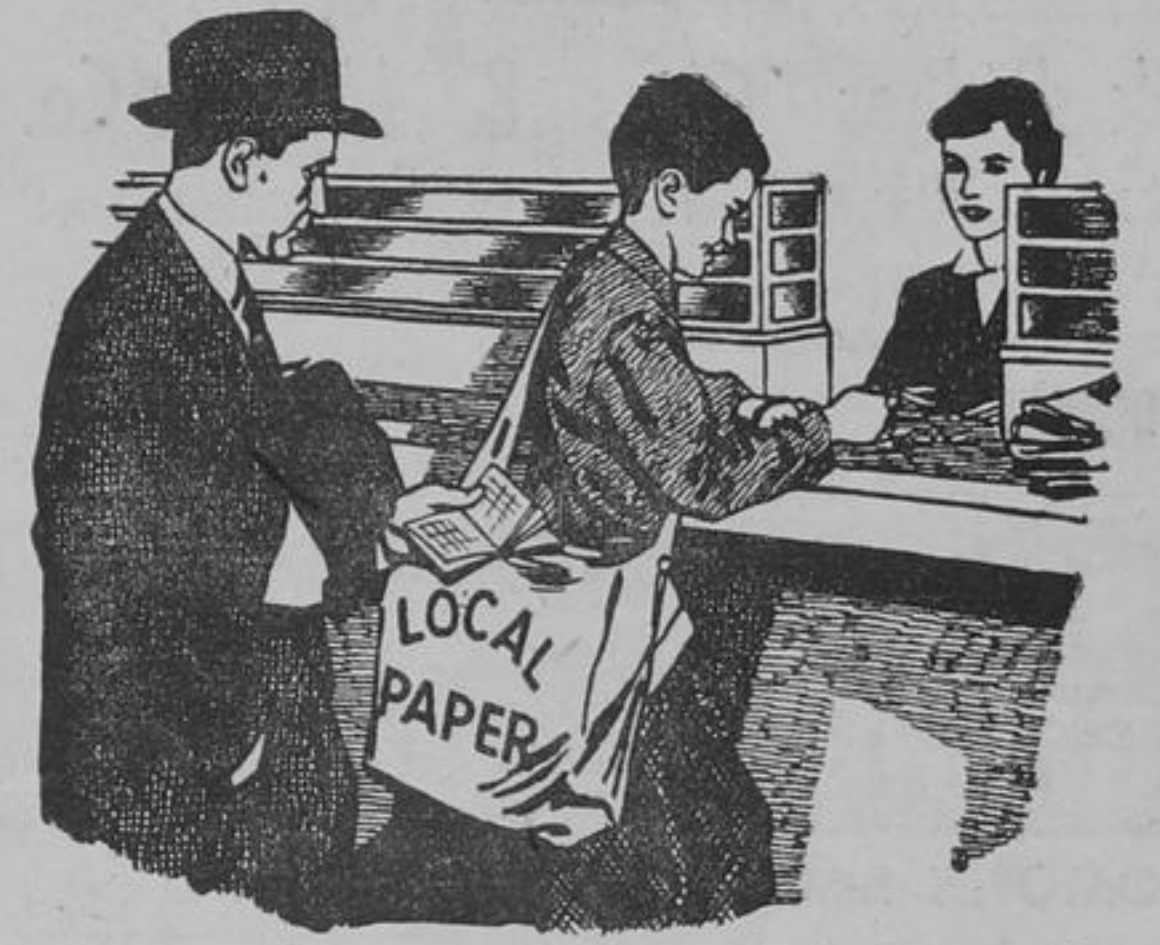
If your main purpose is to save, to accumulate funds, it's good to have a Savings account.