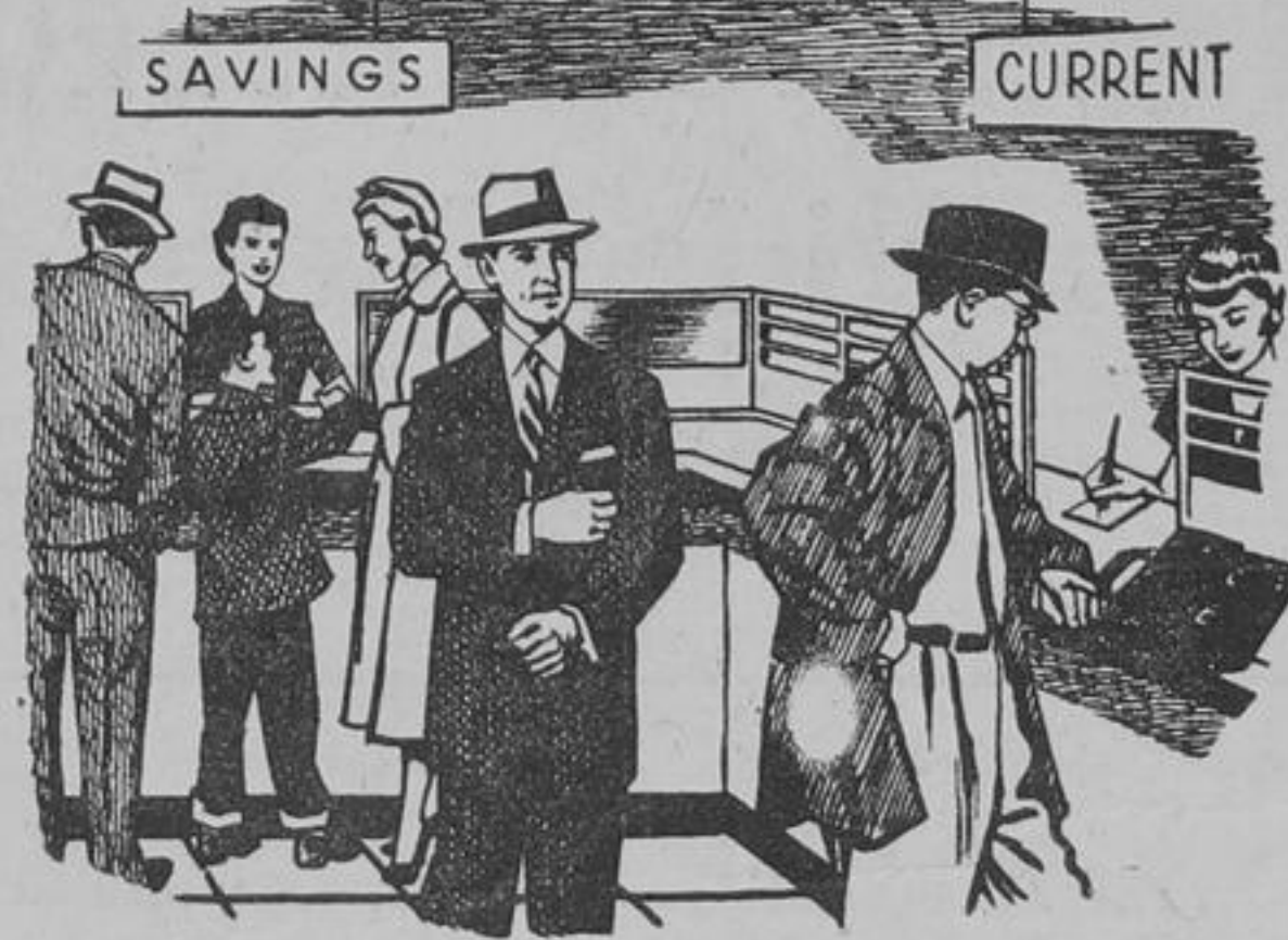
A bank offers you two types of deposit account, Savings and Current.