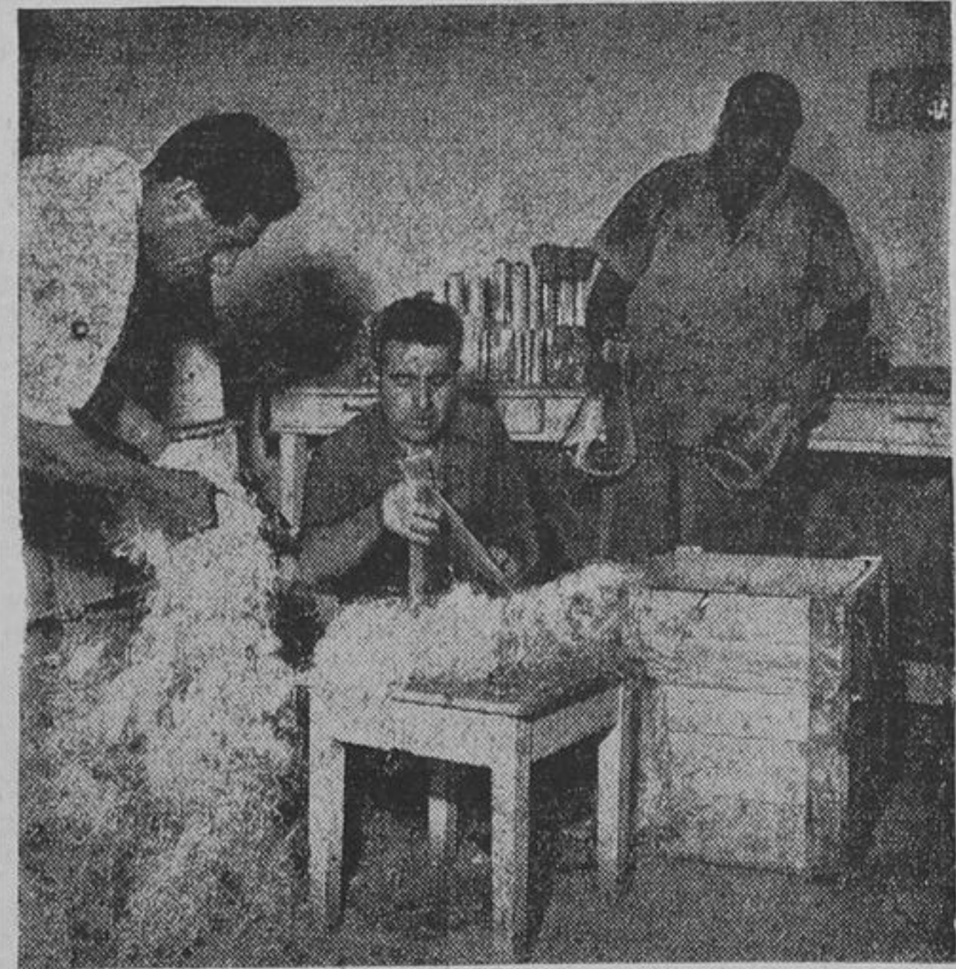
Filling tubes with antibiotic eye ointment, these three Arab refugees in Beirut, Lebanon, are helping to their fellow refugees who suffer from trachoma, a common eye disease in the Middle East. The ointment is being packed at a warehouse operated by the United Nations Relief and Works Agency for Palestine Refugees (UNRWA), which is cooperating with the World Health Organization in an anti-trachoma campaign in refugee camps. The WHO-UNRWA campaign is reported to be achieving a cured rate of eighty percent.