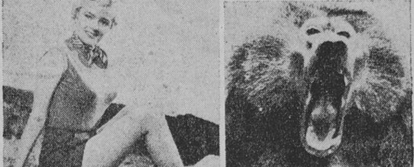
BIG LAUGH given spectators at Edinburgh, Scotland, Zoo by this baboon was a howling success.