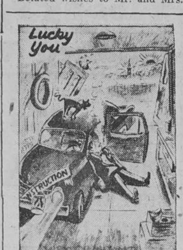
You got home in one piece after that party