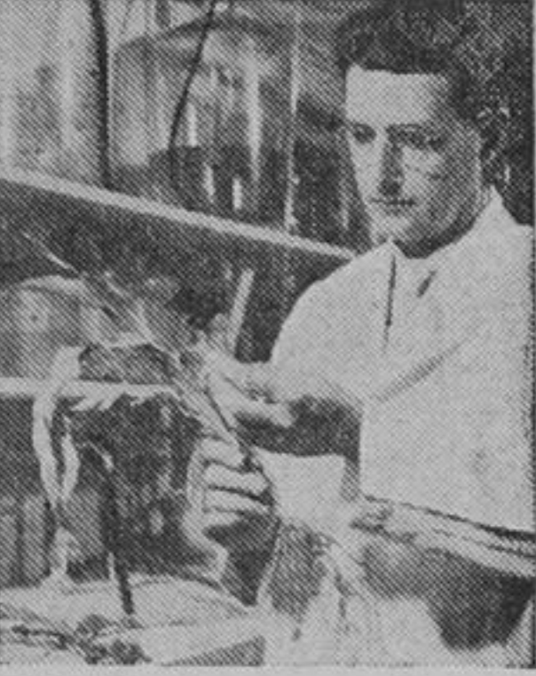
GROWING better crops isn't all done on the farm. The research chemist helps the farmer by developing improvements in fertilizers and pesticides which result in higher yields and better quality.