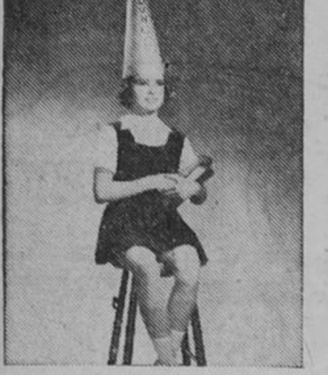
LITTLE GIRL is fooling... knows she's no dunce to be wearing a blouse and socks made of nylon. She'll always win a prize for neatness! Mother gets top marks for knowing nylon leads to easier living - washes wonderfully, lasts so long.